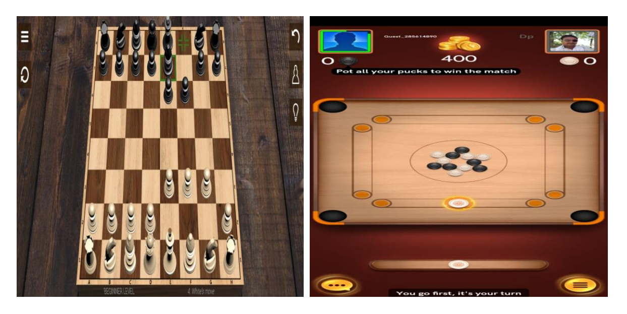
Students Participating in Indoor Games (Chess, Carom)