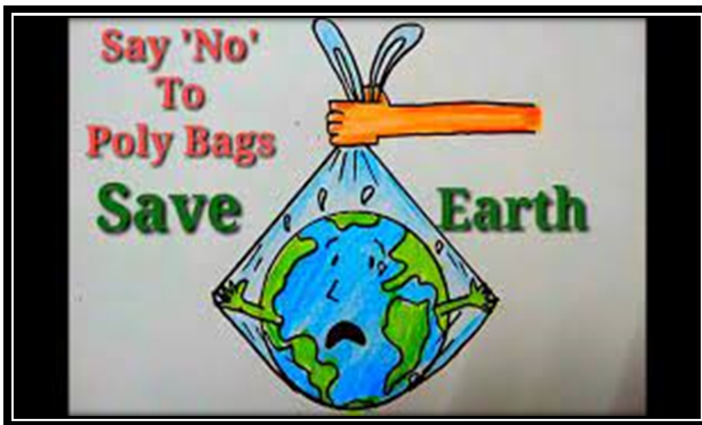
Ayushi Panwar, BCA, 3 rd Semester, Morning Shift