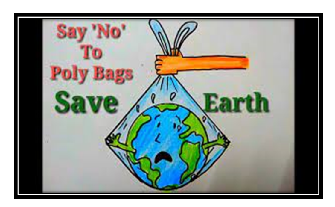
Ayushi Panwar, BCA,3<sup>rd</sup> Semester, Morning Shift