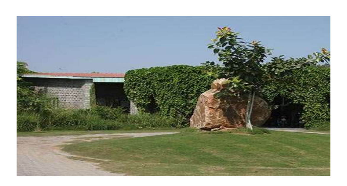
The Nature Interpretation Centre, YBP