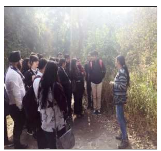
A group of students of BA (J&MC) & BBA have visited to Yamuna Biodiversity Park