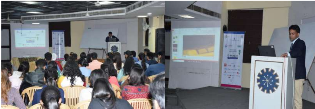
Students attending the Awareness campaign