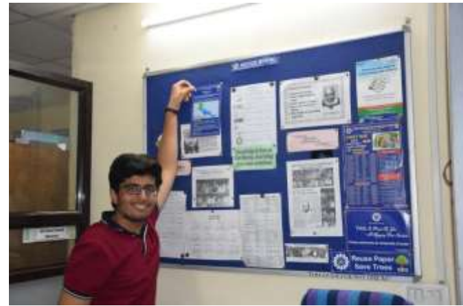
Few glimpses of Campaign