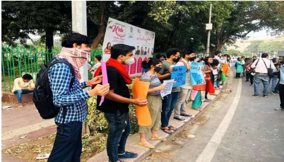
Students Demand end to air pollution

Debates on Air pollution was organized by Eco Club of Tecnia Institute of Advanced Studies, Rohini, Delhi on 21-Dec, 2020. TIAS propagated Eco Club under the aegis of Department of Environment, Government of NCT of Delhi, which is accountable and responsible for enriching the overall Environmental Quality, environmental assessment, monitoring, protection and awareness among the students. Tecnia Institute's Eco Club also plays an important role in creating environmental awareness amongst our future generation.