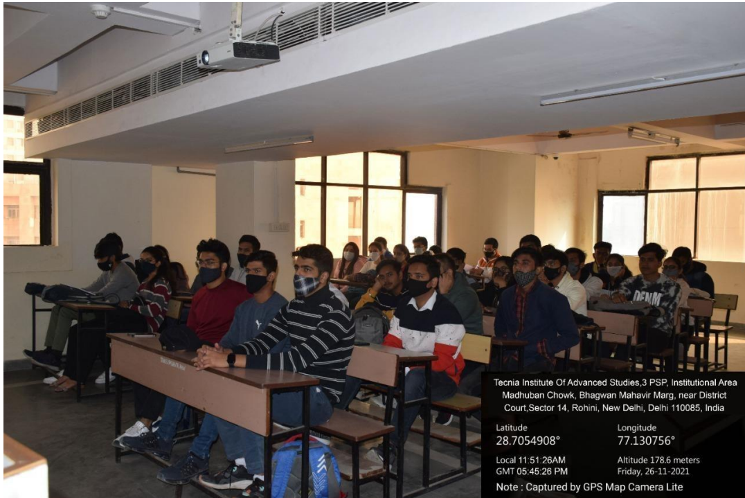
Screenshot of the Seminar: