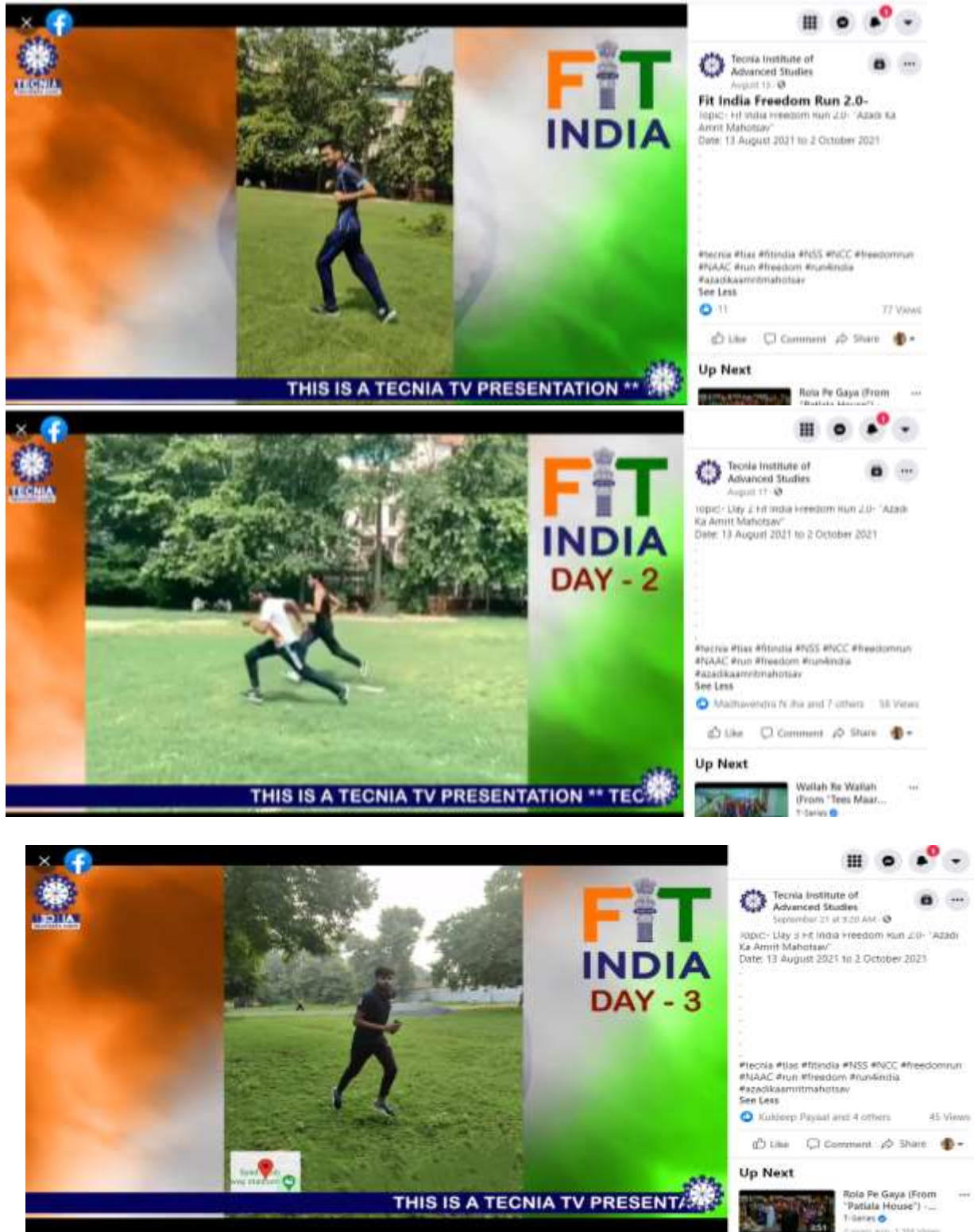
Promotion of Fit India Freedom Run 2.0 event on Tecnia Institute of Advanced Studies official Social Media Platforms