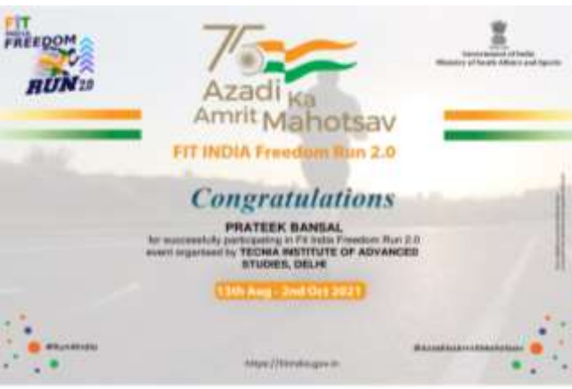
Students Participation Certificated generated from Fitindia.gov.in