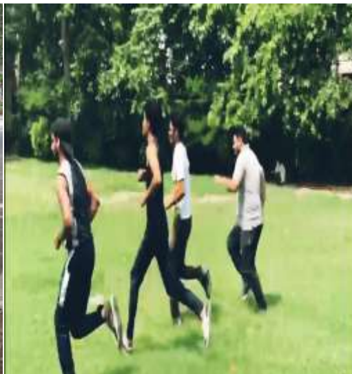
Students Participation in the Fit India Freedom Run 2.0