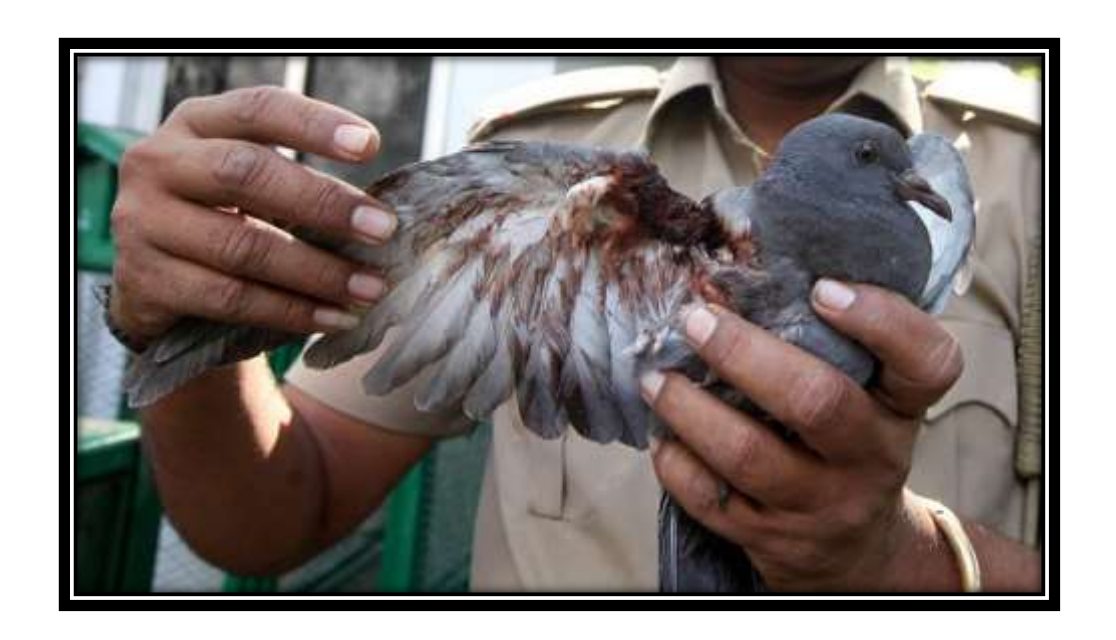
"Sharp Manja"-A dangerous thread