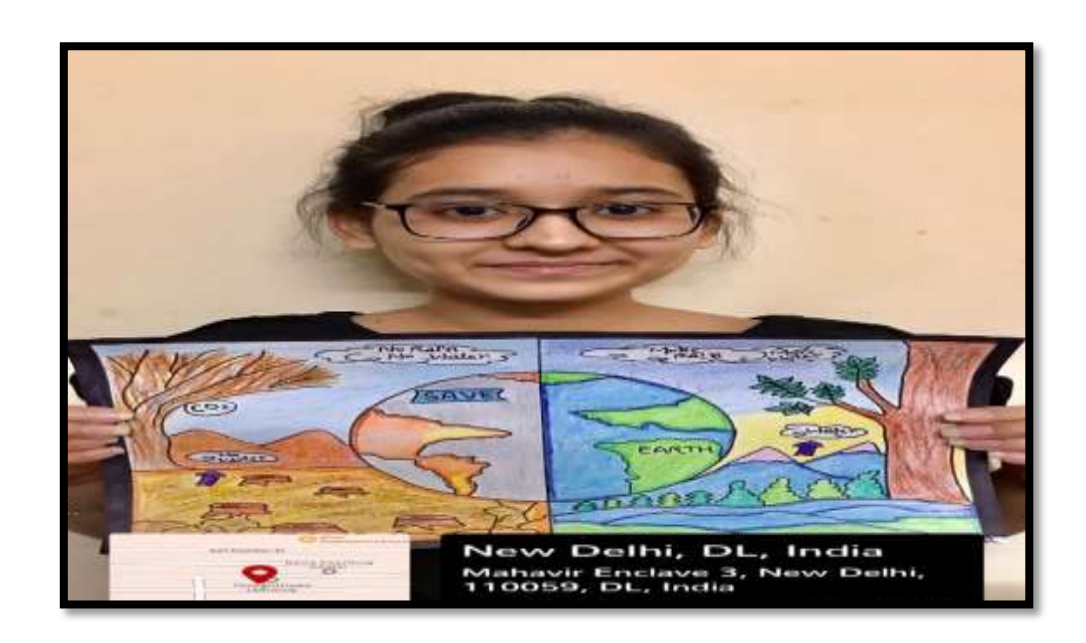
Awareness Campaign attend by the Student of TIAS