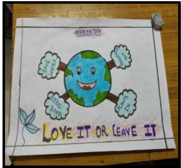
SNEHIL WADWA (BAJ (&MC)