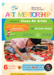
Poster NEW FINAL 17-8 (1).jpg 5405K