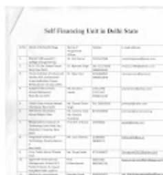
principal 2.jpg 376K