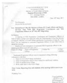
Principal Letter.jpg 354K