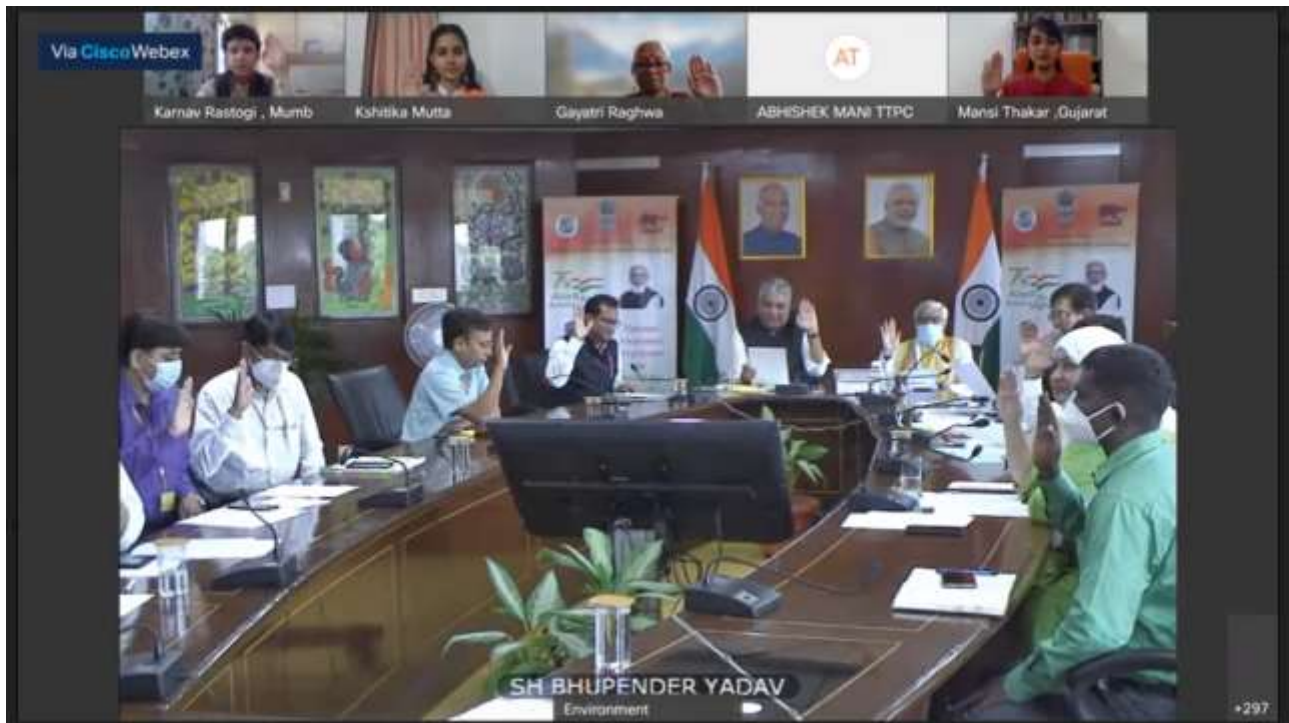
Figure 3:-Taking Pladge