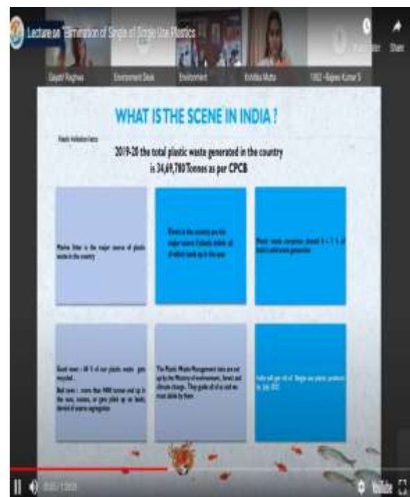
Figure 2:-Session Presentation by Guest