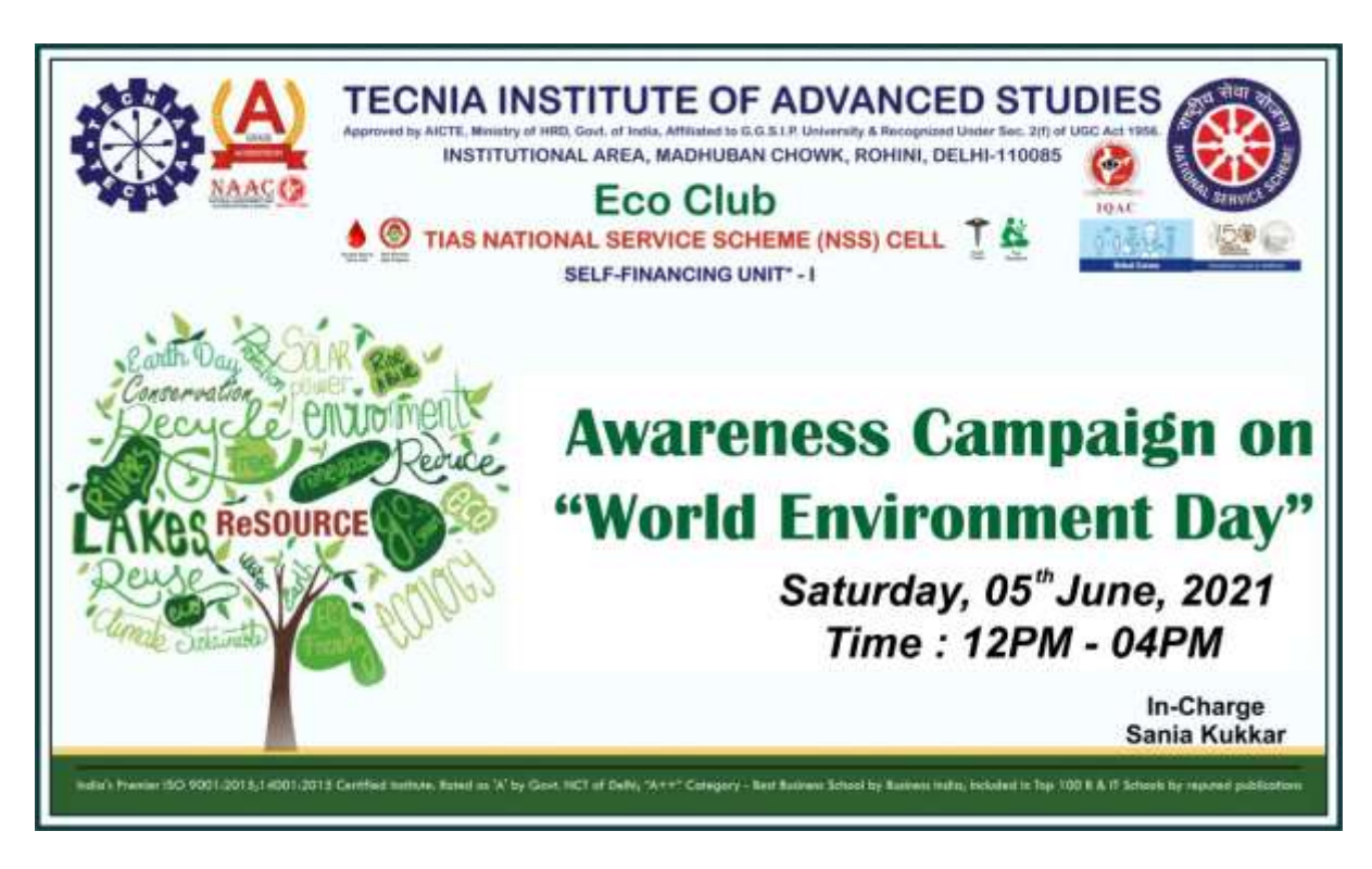
Awareness Campaign on World Environment Day