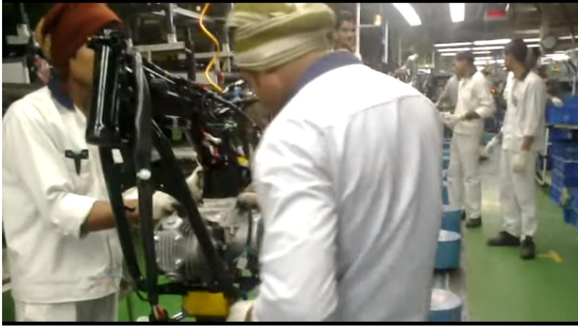
Manufacturing process of Hero Motor Limited