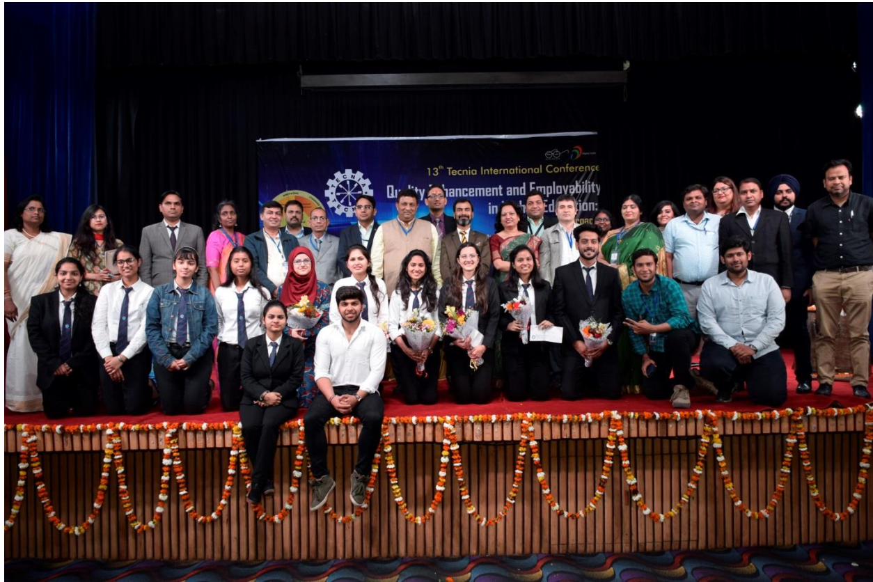
Delegates Photo Session