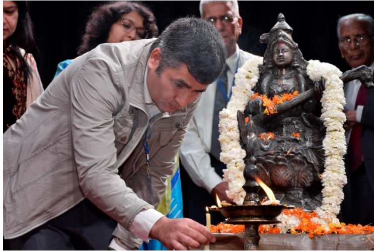
Lighting of Lamp