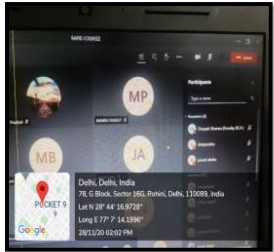
Figure 3: Ayush Jagga Participated in Rapid Coredezz