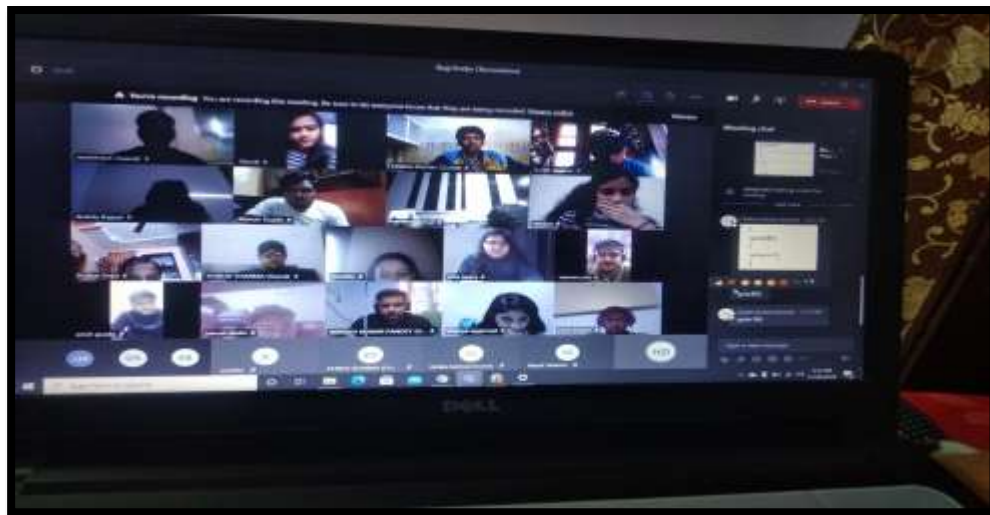
Figure 6:Students Attended the valedictory session