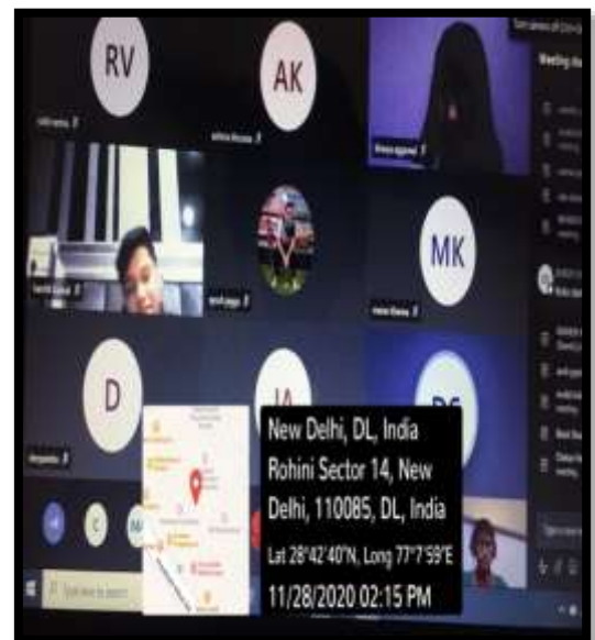
Figure 4:-Kritika Participated in Bug-Finder