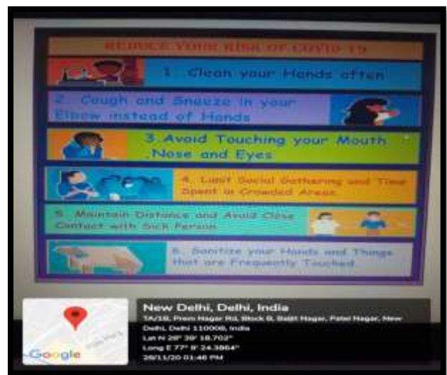
Figure 2: Isha Batra Participated in E-poster