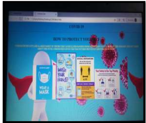
Figure 1: Bhaya Aggarwal Partipated in Web scape