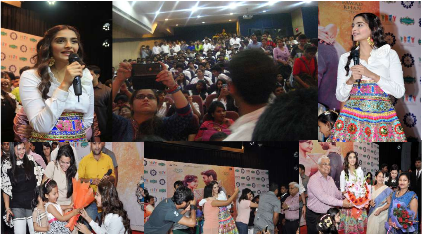
FILM ACTRESS SONAM KAPOOR IN TECNIA INSTITUTE OF ADVANCED STUDIES