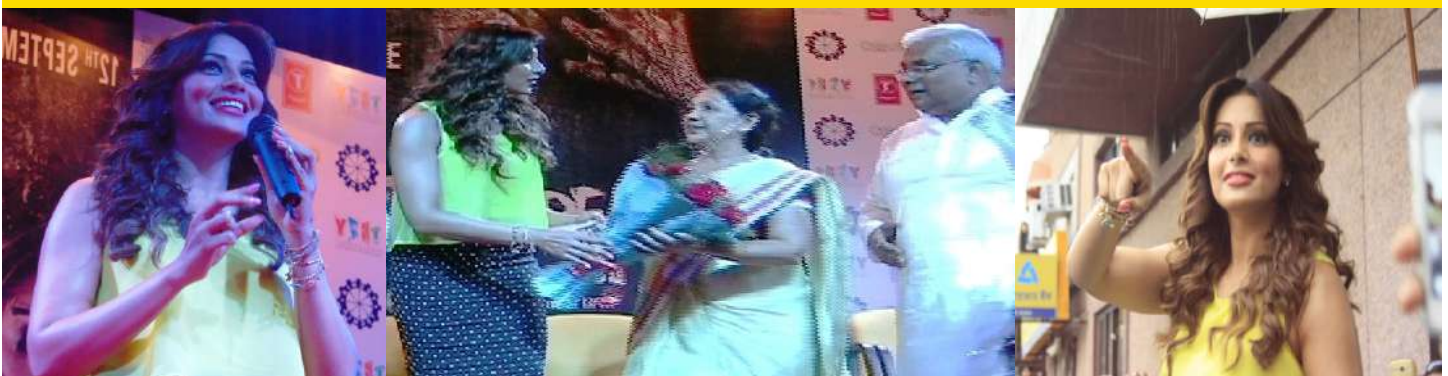
FILM ACTRESS BIPASA BASU IN TECNIA INSTITUTE OF ADVANCED STUDIES