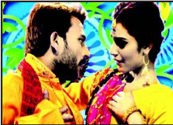
A still from 'Zinda Bhag', Pakistan's first entry to the Oscars. The film grossed 75 lakh Pakistani rupees in its first week