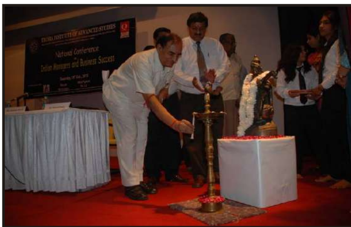
Lamp lighting ceremony by Honorable Chief guest and other Dignitaries