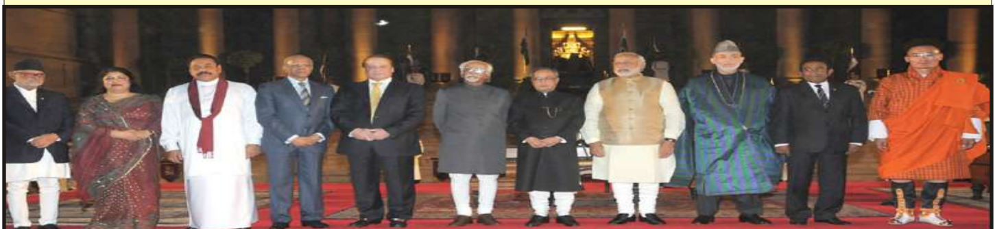
The President, Pranab Mukherjee, the Vice President, Mohd. Hamid Ansari and the Prime Minister, Narendra Modi with the Heads of SAARC countries after the Swearing-in Ceremony, at Rashtrapati Bhavan, in New Delhi

He leads a team of 45 ministers 23 of them in the cabinet rank which is distinctly leaner than the outgoing UPA ministry. It's a team that bears his personal stamp, with many of the ministers owing him their position, and reflects his resolve to form his ministry without being encumbered by