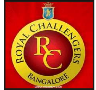
ROYAL CHALLENGER BANGALORE