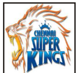
CHENNAI SUPER KINGS

Mahendra S Dhoni (C) Dwayne Bravo Murali Vijay Albie Morkel Shadab Jakati Suresh Raina Ravichandran Ashwin Subramaniam Badrinath Doug Bollinger Ben Hilfenhaus Michael Hussey