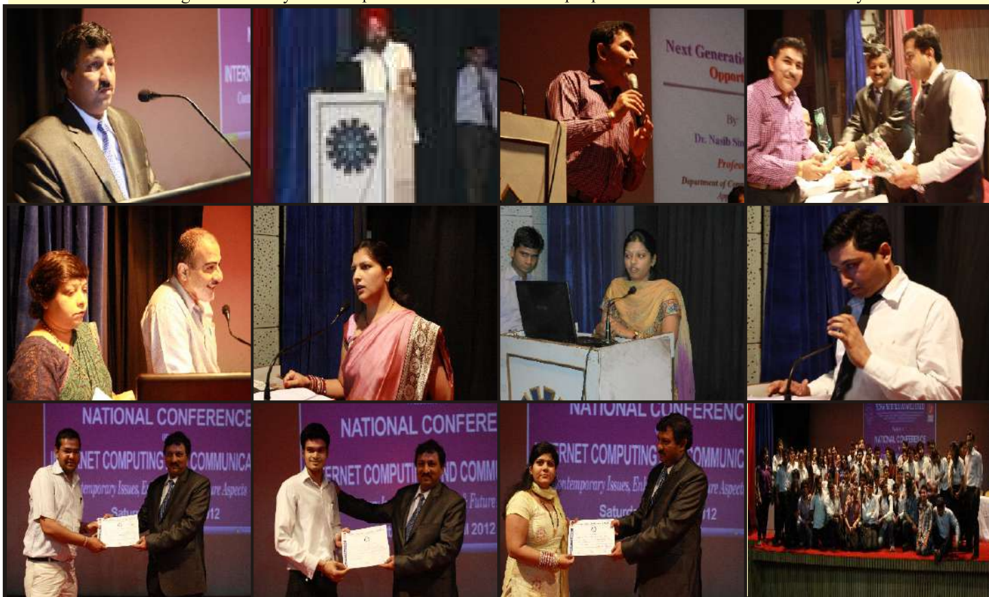
Glimpses of National Conference on "Internet Computing and Communication- Contemporary Issues, Enhancement & Future Aspects"

For Industry: Many new ideas were presented by the researchers. These ideas will be useful for industry to find solutions to the problems faced by them. We expect that these ideas and further developments will contribute to industry in near future.