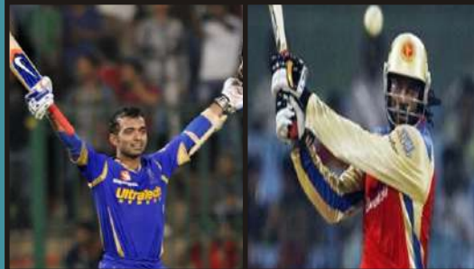
Ajinkye Rahane and Chris Gayle in IPL 2012