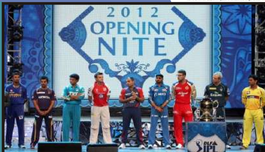
Opening ceremony of IPL 2012