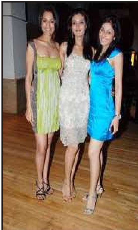
Impact of films on clothing

However, there are other opinions also. One opinion proposes that this is a deliberate attempt of some foreign agency such as CIA to publicly malign our country's moral image in the eyes of the world. Our country has been known for high moral standard