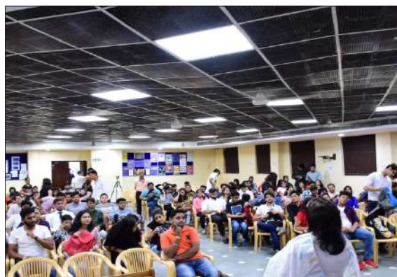
ओरिएंटेशन प्रोग्राम के दौरान छात्र- छात्राएँ