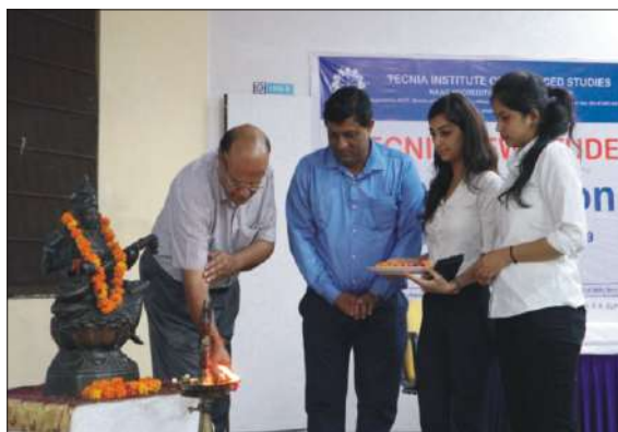
दीप प्रज्वलित करते हुए मुख्य अतिथि