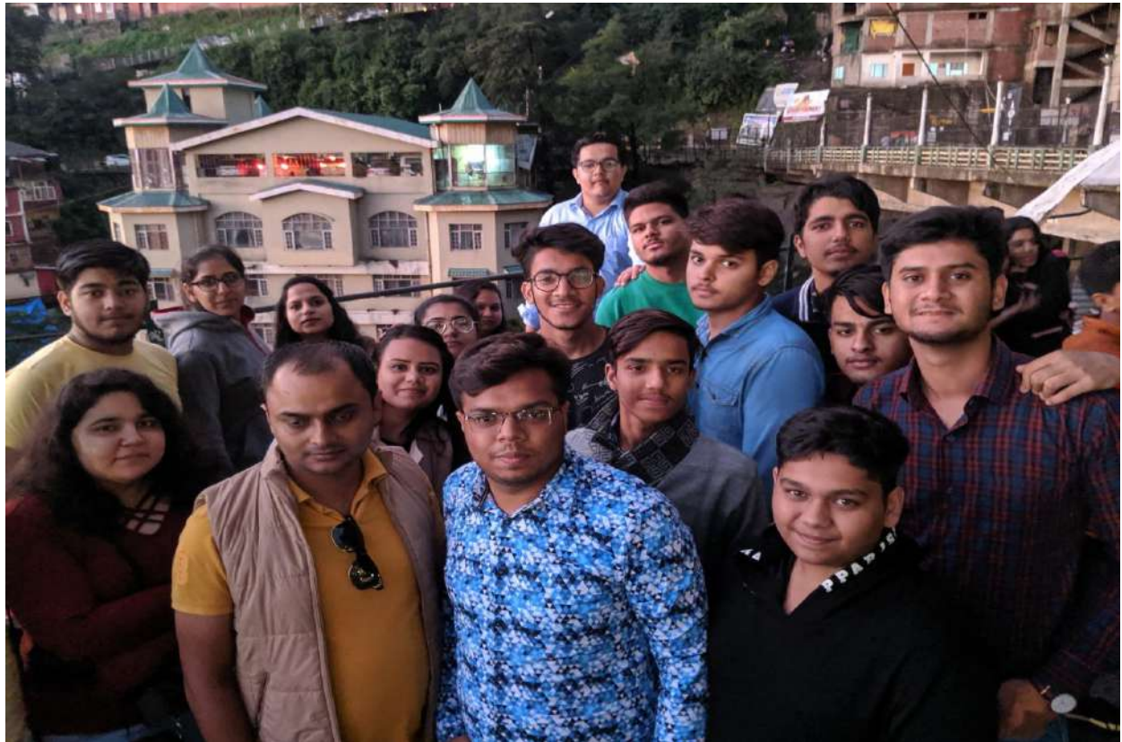
View of Mall road in shimla