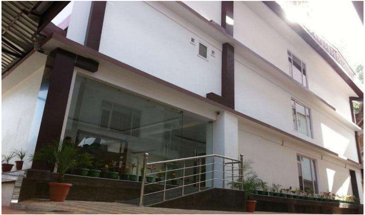
View of hotel in Shimla