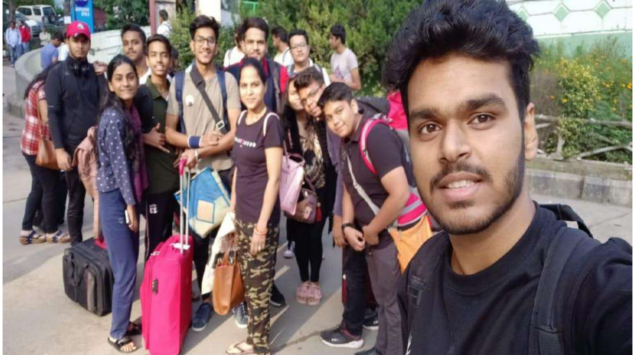
Reach the destination