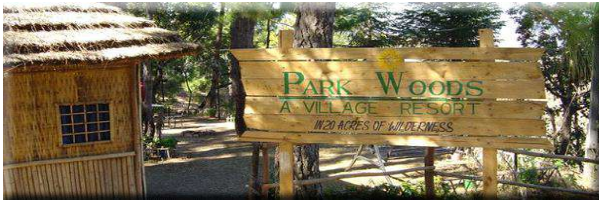
Shogi Resort Park Wood In Middle Of Forest

On this day, the students moved out for the Shoghi to see the amidst an emerald pine forest. It is 18 kms before Shimla. Here, students learnt that many exciting adventure and activity based outbound training and team building programs by certified outdoor instructors. The students experienced the natural bliss of the surroundings and the importance of being disciplined & cautious on such an adventurous activity.