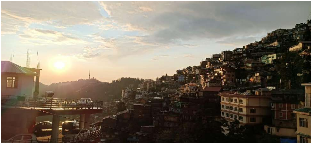
Sunset View in Shimla