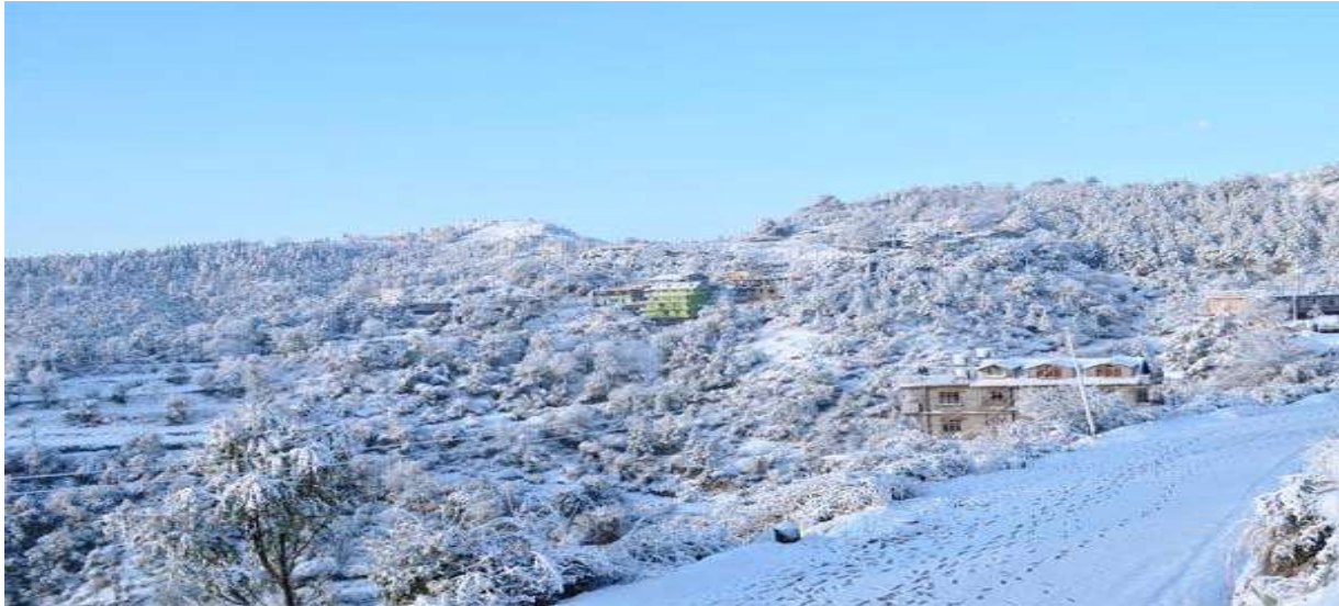
View of Shimla