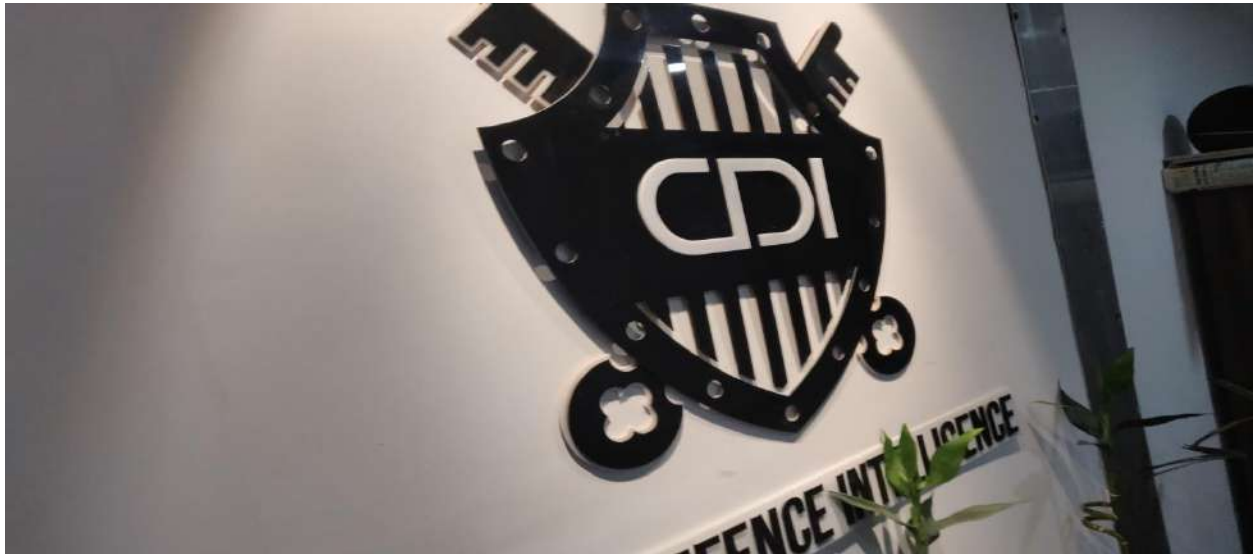
Logo Cyber Defence Intelligence