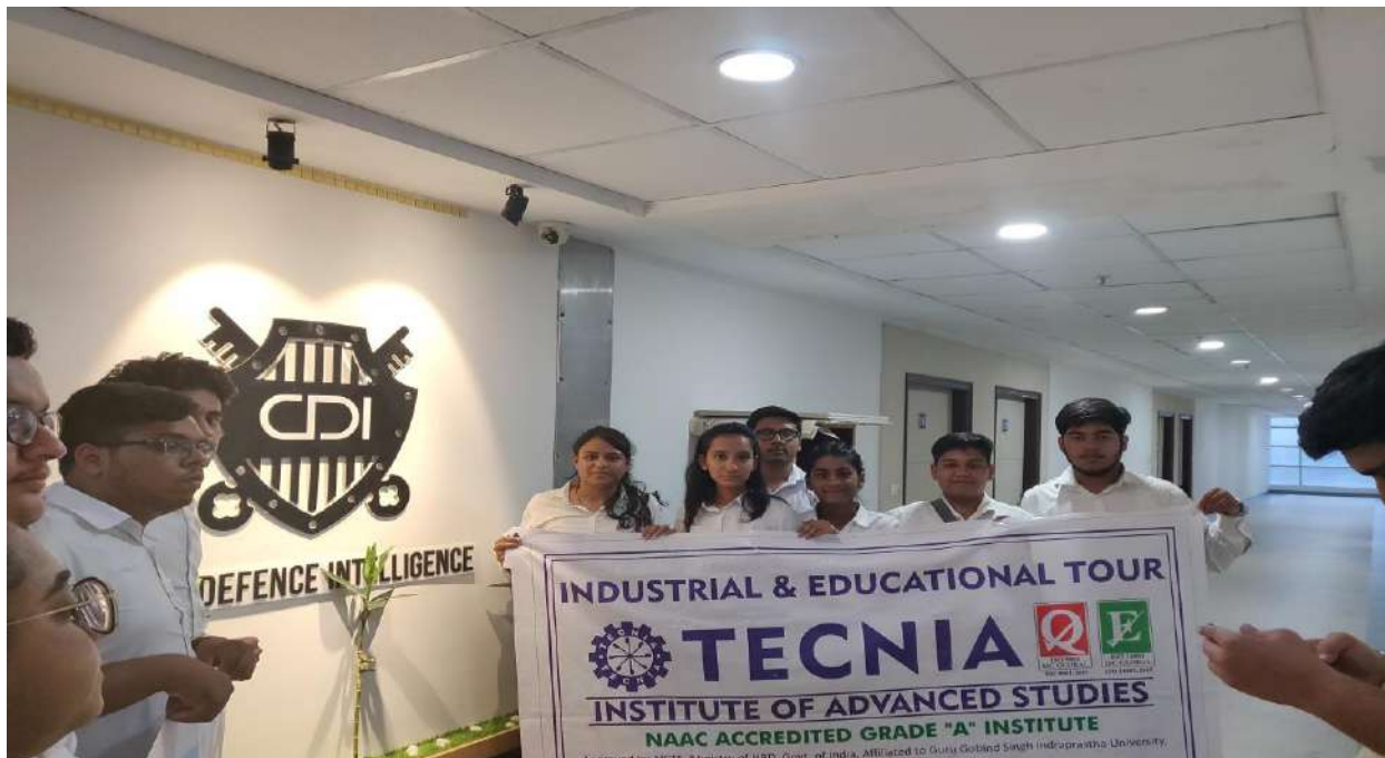
BCA students of Tecnia Institute of Advanced Studies , Delhi visited CDI HQ ,Mohali