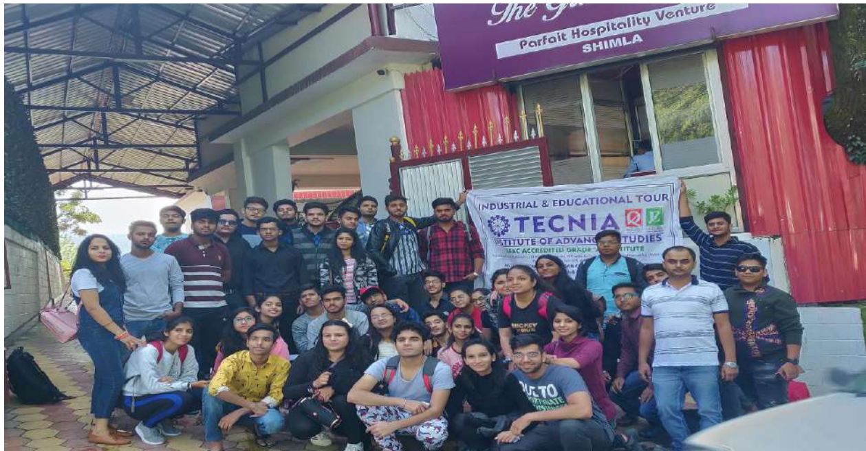
Students in Shimla

On this day, the students moved out for the Shoghi to see the amidst an emerald pine forest. It is 18 kms before Shimla. Here, students learnt that many exciting adventure and activity based outbound training and team building programs by certified outdoor instructors. The students experienced the natural bliss of the surroundings and the importance of being disciplined & cautious on such an adventurous activity.