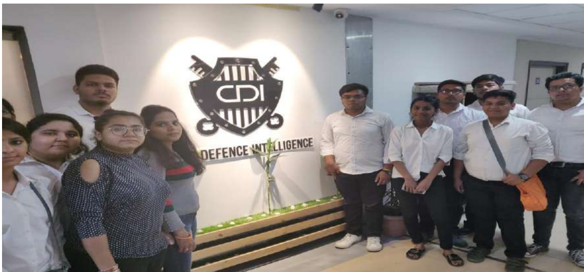
Cyber Defence Intelligence, Mohali

Students visited “ Cyber Defence Intelligence ” is an emerging Information security company with an aim to provide information security solutions to clients with wide array of platforms: Networks web applications, servers and databases. CDI follows global standards while performing penetration testing operations to ensure integrity, availability and confidentiality of Data