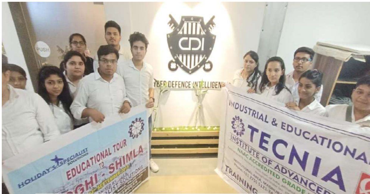
BCA students of Tecnia Institute of Advanced Studies , Delhi visited CDI HQ ,Mohali