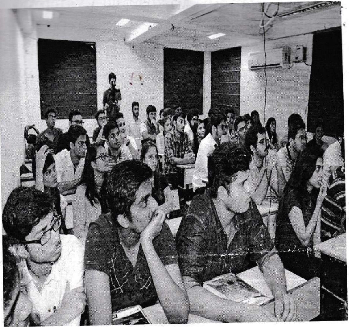
Students getting input about the scope and prospects after Graduation

Handwritten notes on the left margin, partially cut off. Visible text includes "Reply to", "Fundamental", "Law", and "The".