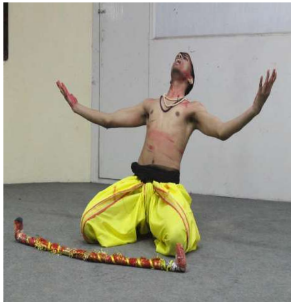
Student performing in mono-acting competition