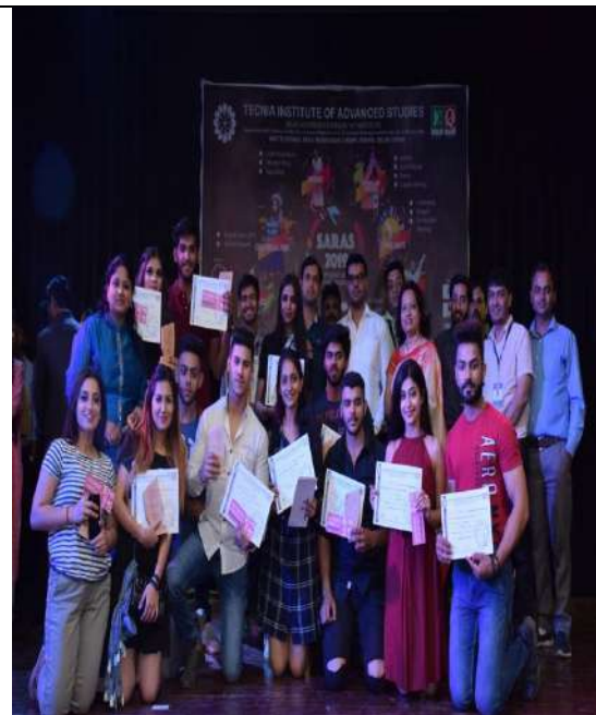
Students from TIAS won First position in Fashion Parade