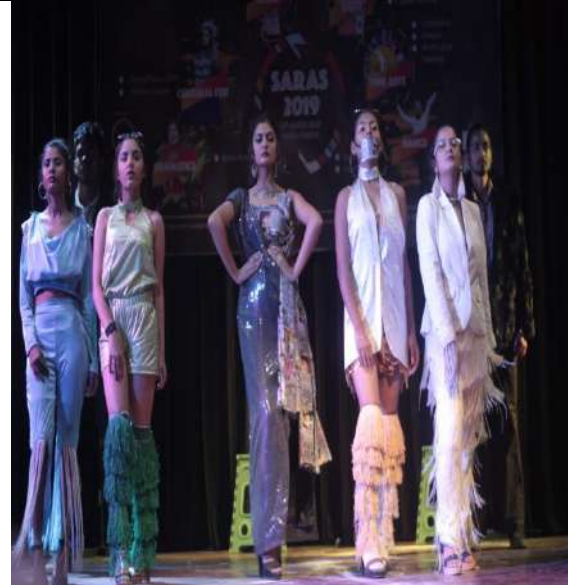
Team of DU performing in Fashion Parade