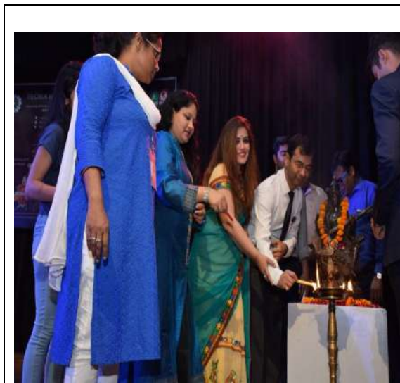
Lamp Lightening Ceremony.