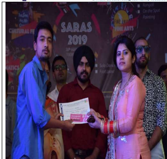
Student from Tecnia Institute won first position in literary event