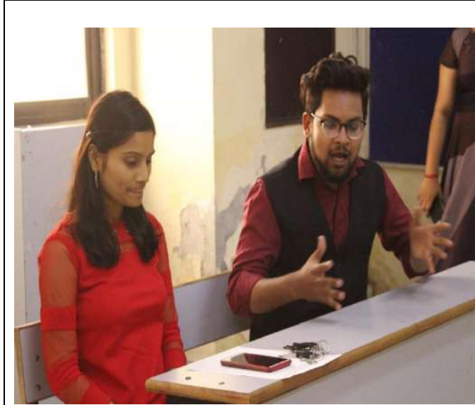
Student participating in Debate Competition.