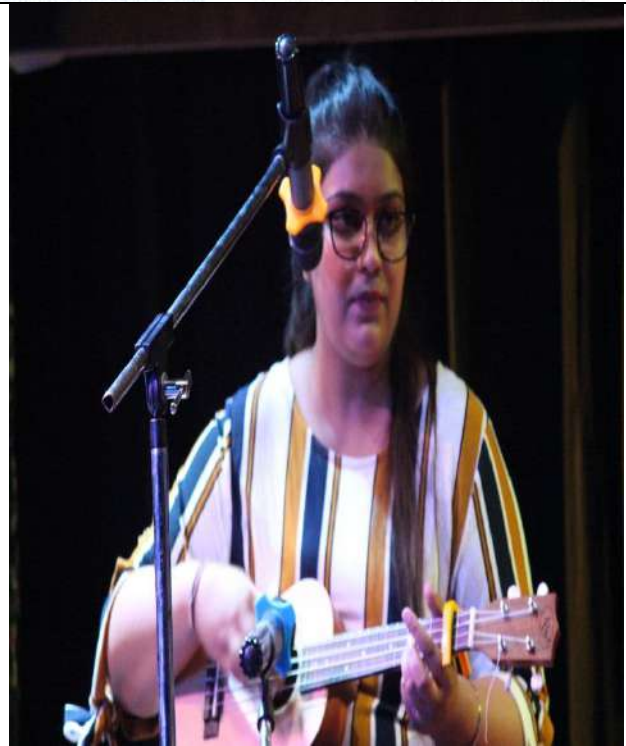
Student from GIBS performing in Solo Singing Competition