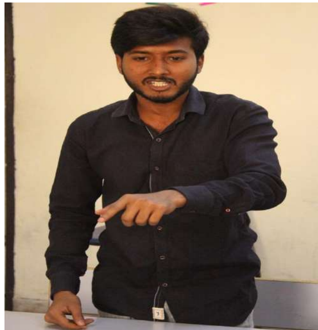
Student participating in JAM competition