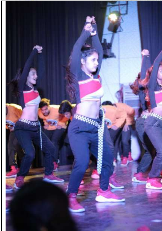
Students from Delhi University performing in Footlose