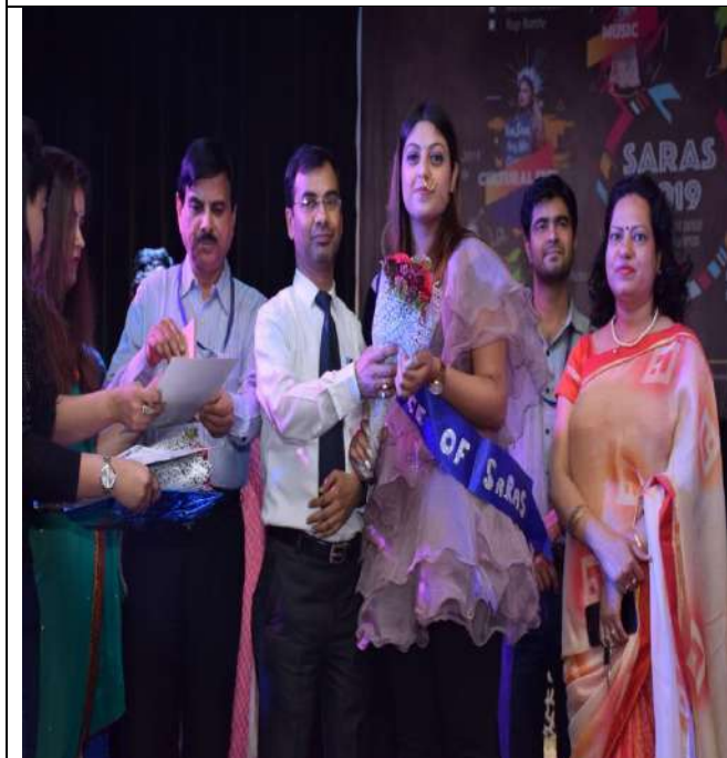
Student of TIAS won title as Face of Saras