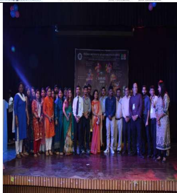
A Group photograph of TIAS Faculty