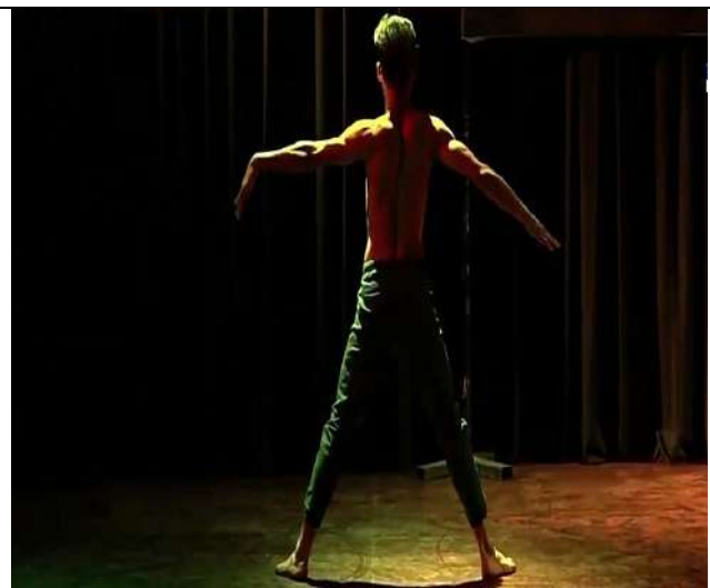
Student performing in Solo Dance Competition