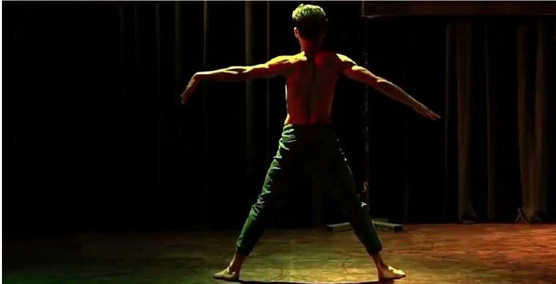
Student participating in Solo Dance.