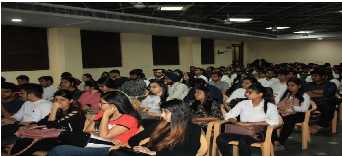
Students attending the Seminar.

There was a Question & Answer session after the Seminar. Students asked different questions related to practical implications of the business.