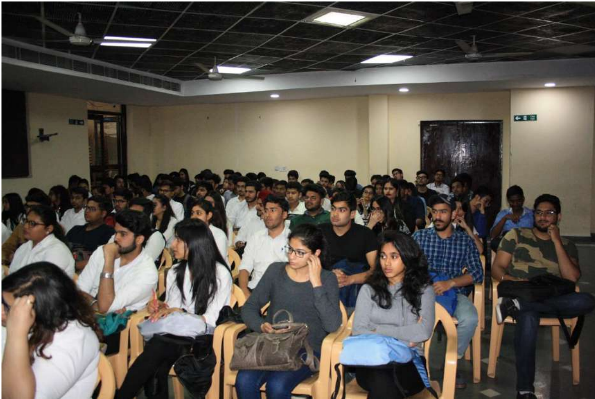
Student's listening to the Speaker.