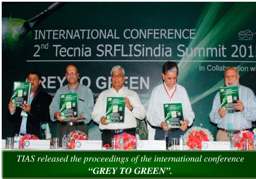
TIAS released the proceedings of the international conference “GREY TO GREEN”.