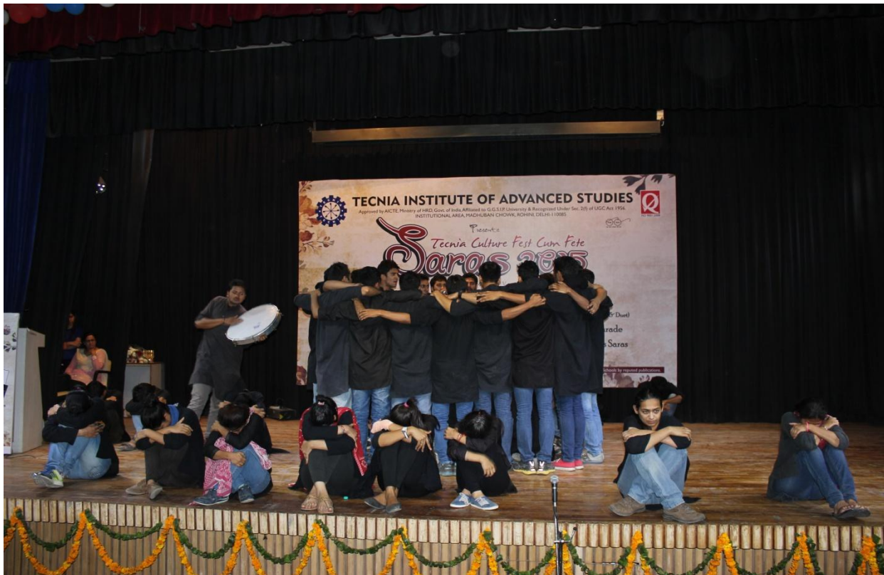
Street play “Dastak” performed by Smita Group