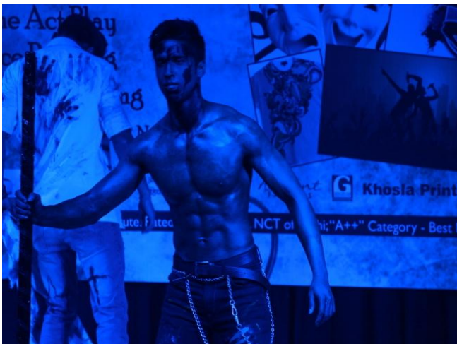
Students of team "Halloween" MBA, TIAS, performing Fashion Parade.

You want to win some beauty pageant? Here is where you can begin to dream about it by walking on the ramp for Fashion Parade. Fashion Parade was such a thrilling, high adrenaline and exciting event of SARAS- 2015.