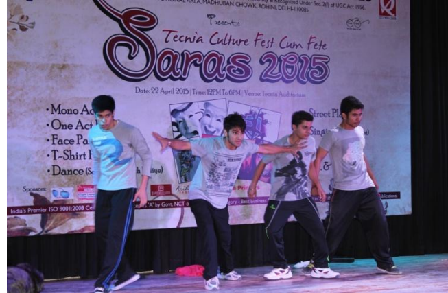
Performance of Dance Group Beatmanix, TIAS