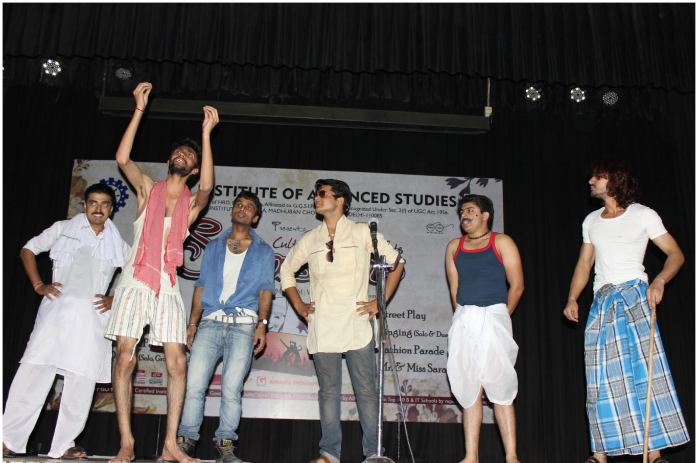
Toli Group performing One act play” Gareeb Das”