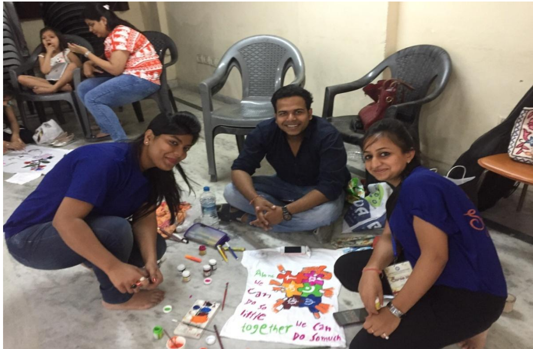
Participants showcase their art skills on the T-Shirts