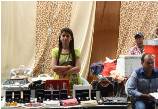
Stall by Ladies Accessories.