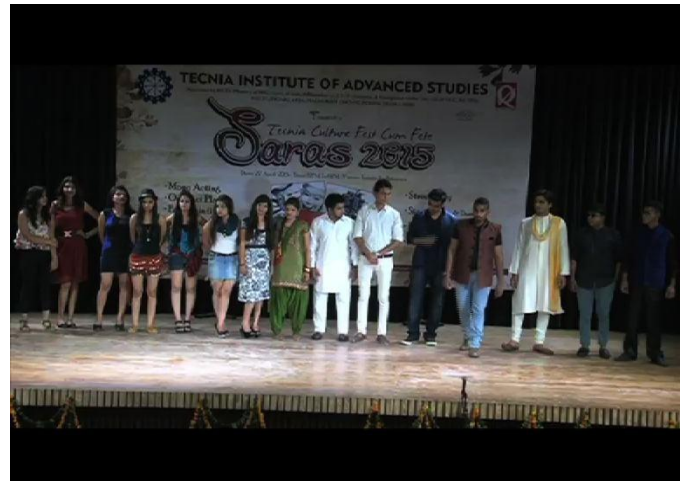
Participants of Ms and Mr SARAS