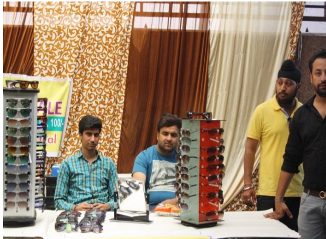
Shades by Stylist optical.

There's great live entertainment on the main stage and on the backstage different varieties of delicious food Stalls, fabrics and fashion wear, stylist sunglasses and fun games added the flavor to the event.