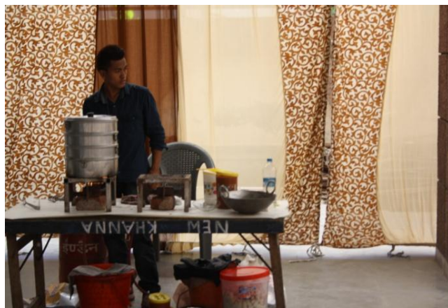
Mouth watering stall of memos.