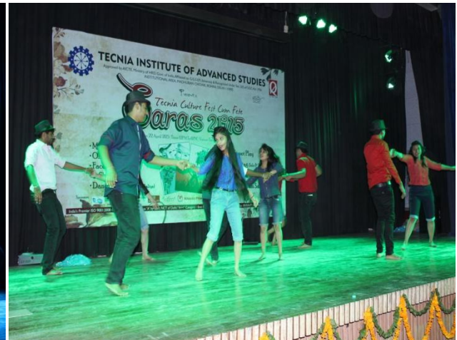
Group Dance performed by D3