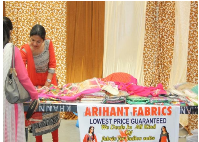
Fashion wears by Arihant Fabrics