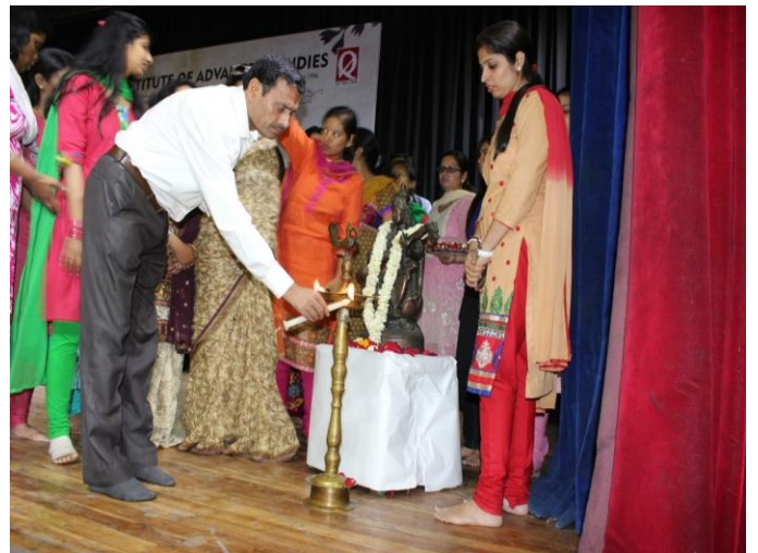
Lighting of lamp

Students from TIAS and various other colleges participated with full zeal and enthusiasm and all the events were conducted as scheduled.