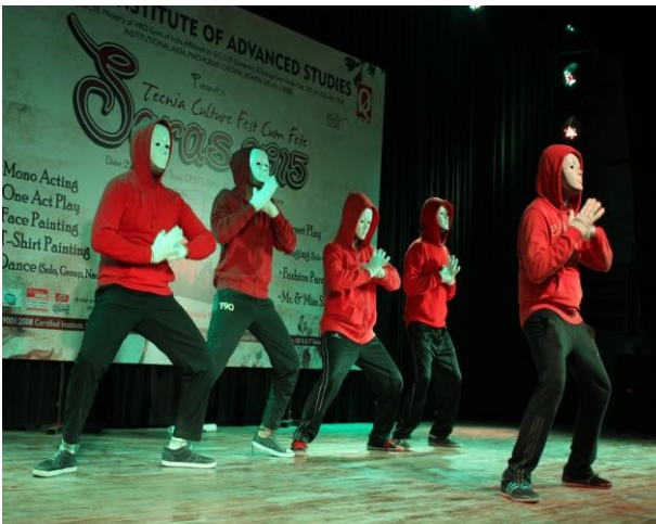
The V group, TIAS performing in group dance.