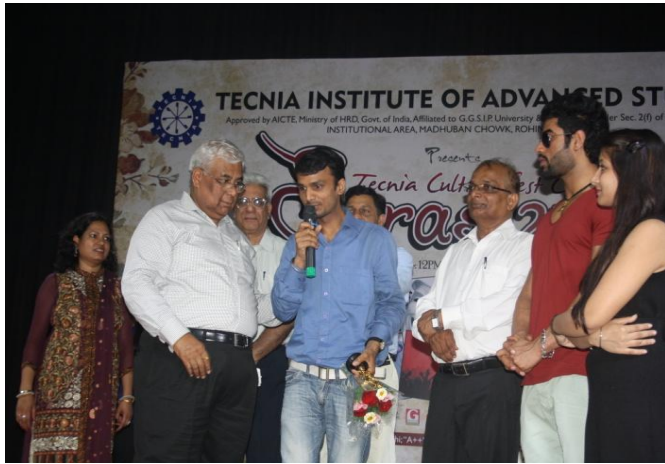
Toli Threater group receiving 1st Prize in One Act Play