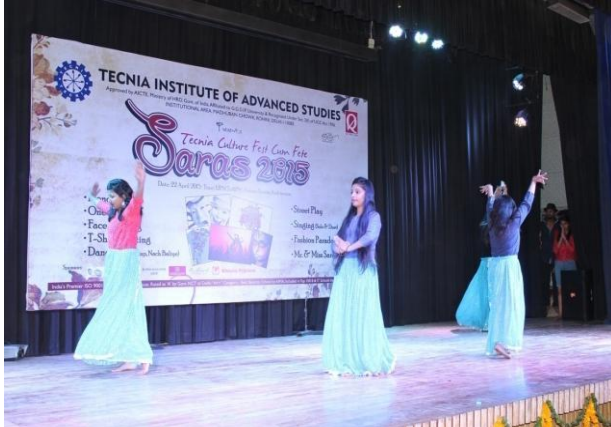
Group Dance performed by "Dazzlers" TIAS.