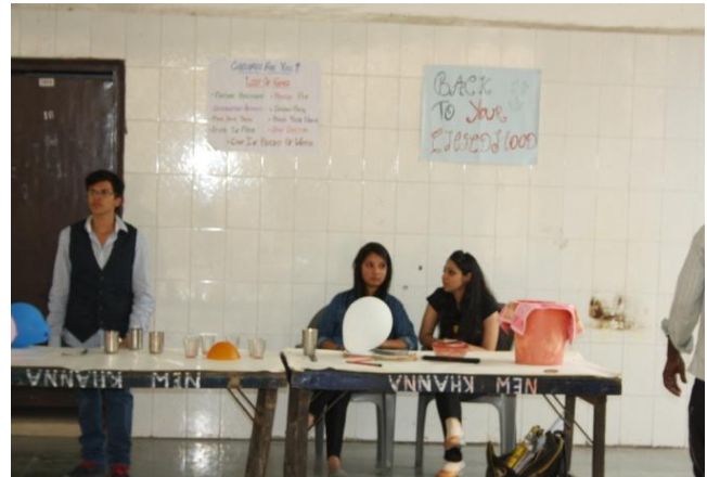
Games stall by students