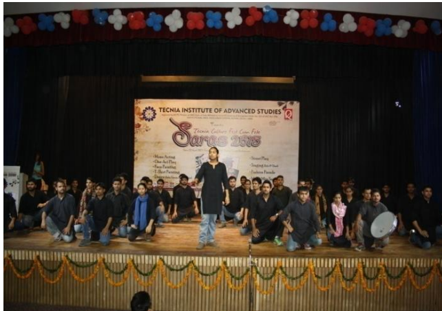
Street play “Dastak” performed by Smita Group

Both the street plays were amazing and won lot of appreciation by the audience.