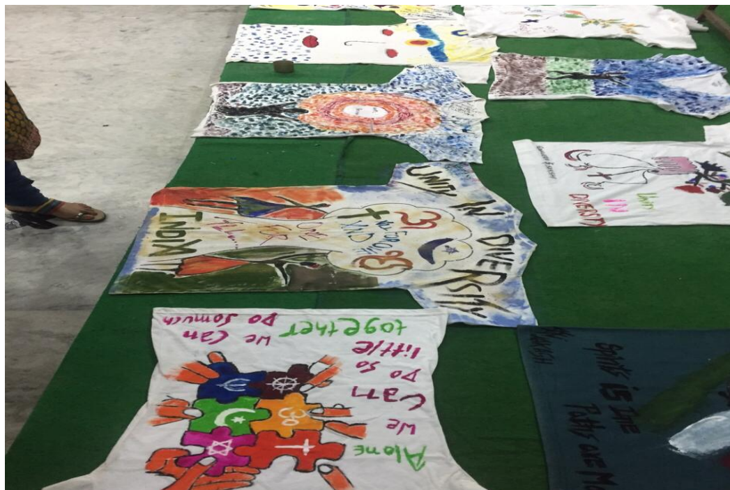
Painted T-Shirts displayed after the event.