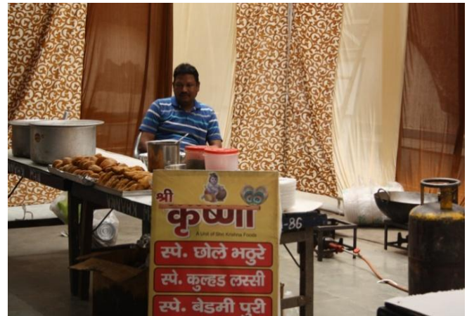
Delicious food by Sri Krishna