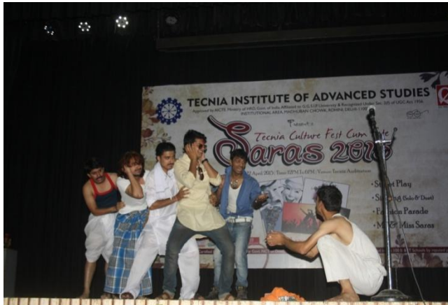
Toli Group performing One act play” Gareeb Das”

Two one Act Plays were performed “Gareeb Dass” A comic play was performed by students from Toli Theaters under the aegis of R.K. Films. Another play “Ma tujhe salam” which was also a comedy play was performed by KIET, UP technical university students.