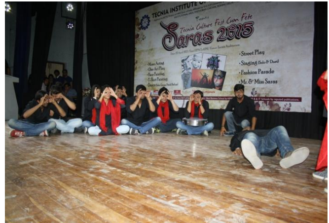
Street plays “Soch” performed by RDIAS Students