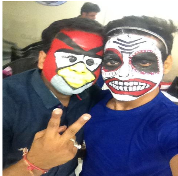
This is how students are looking after face paint