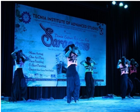
Group Dance performed by International Villagers