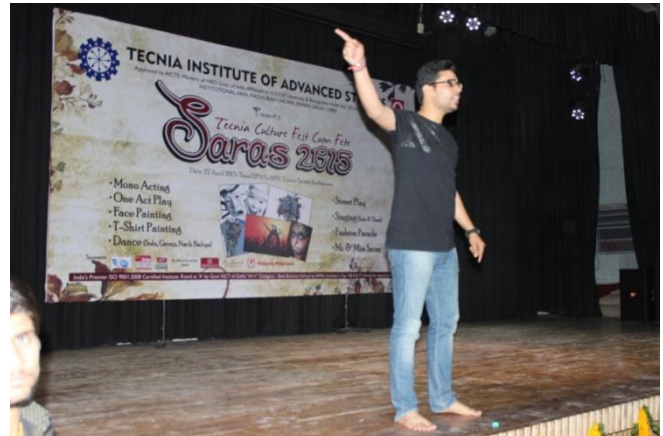
One act play “Maa tujhe Salam” performed by KIET, UPTU Students.