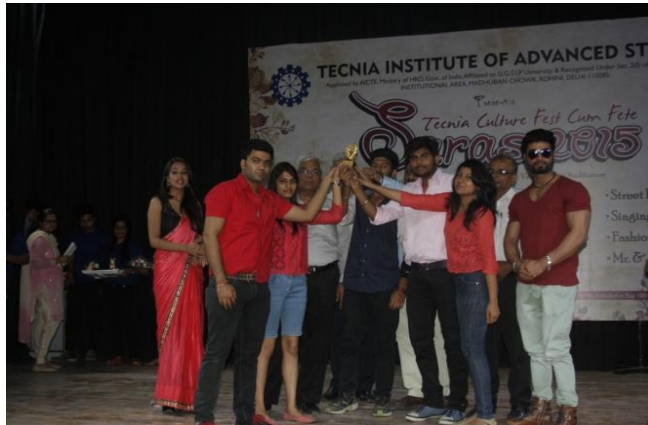
Dazzlers group receiving trophy in Group Dance