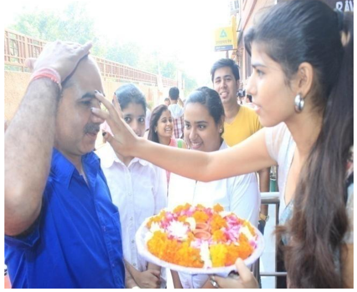
Traditional well Come to the dignitaries