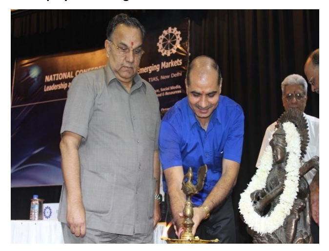
Saraswati Vandana and lighting the Lamp by the distinguished Guests