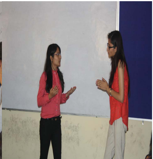
Participants in Role Play