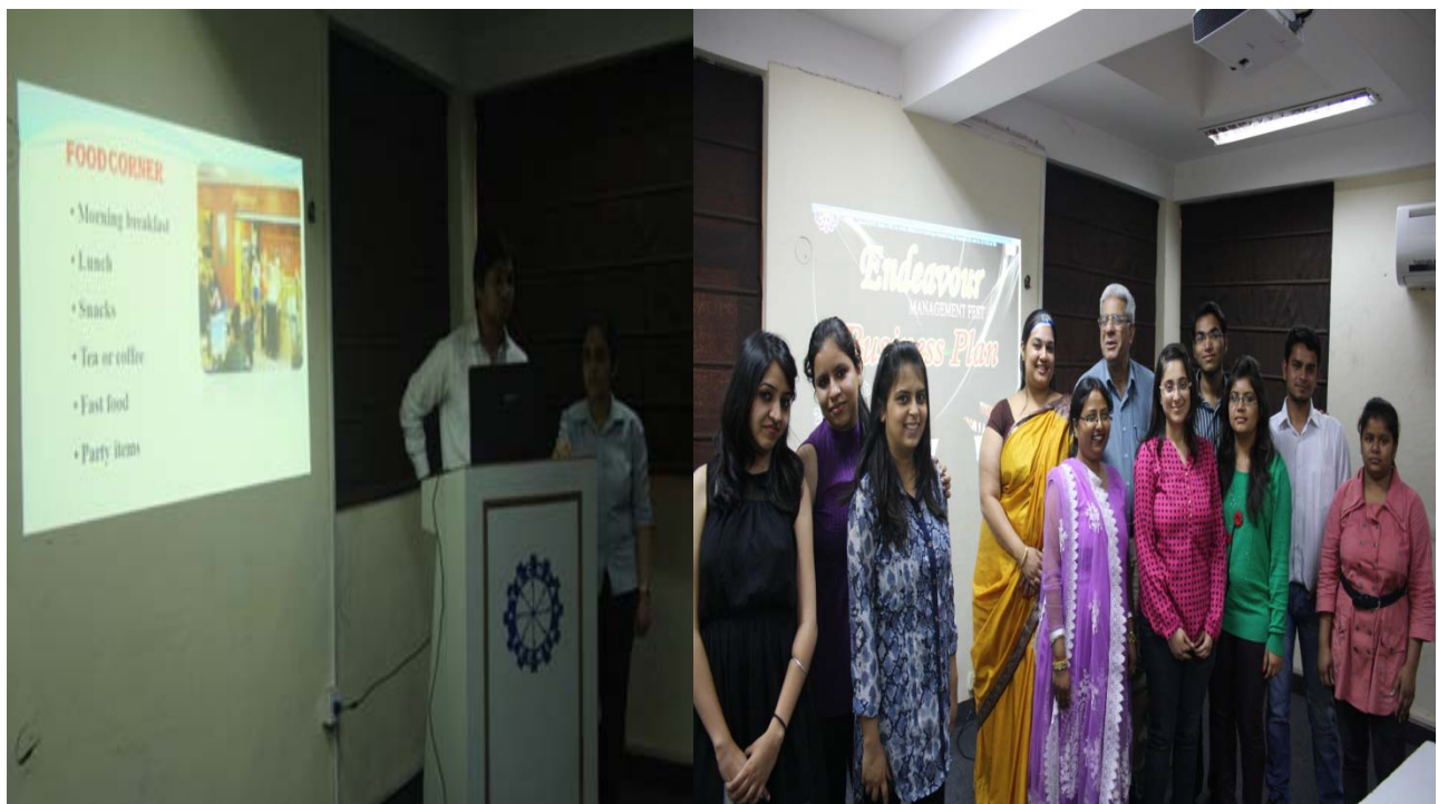
Students' Participation in Business Plan