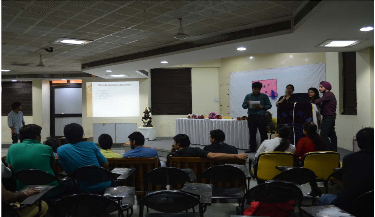
Students' Participation in Quiz