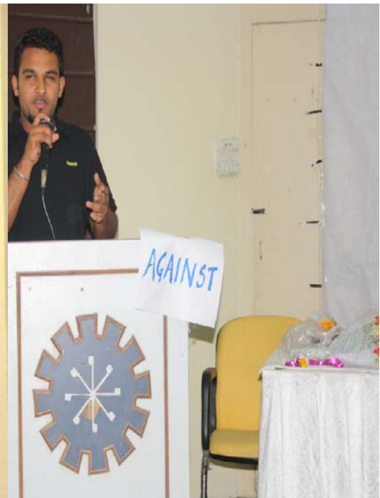
Students' For and Against The Motion in Debate