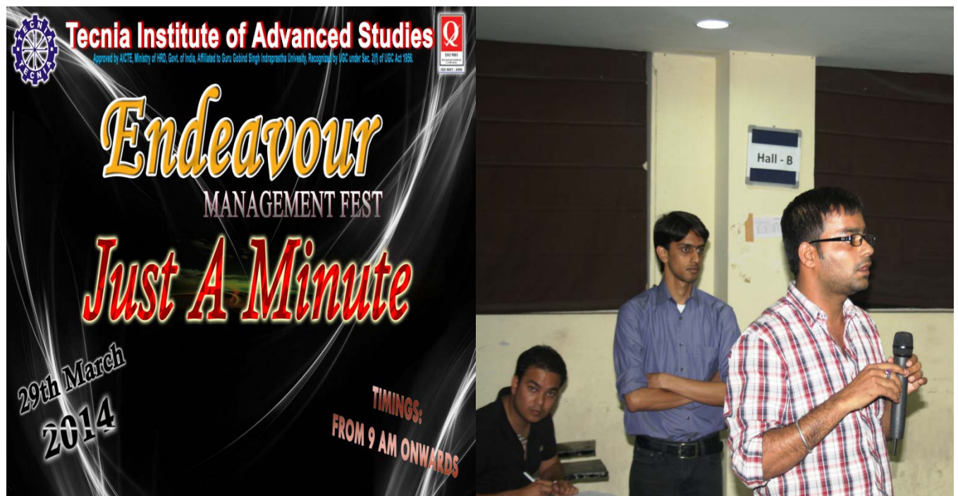
Student's Participation in Just A Minute