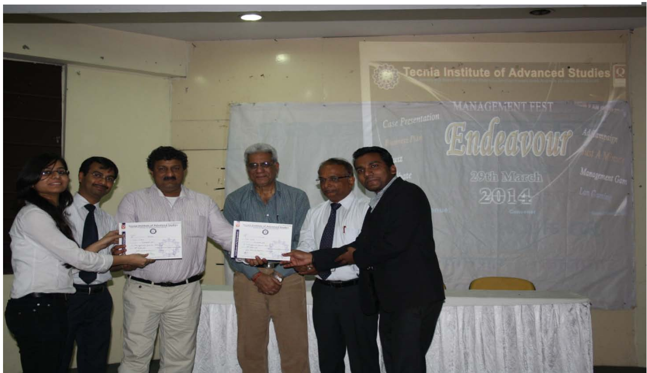
Prize Distribution Ceremony

An ISO 9001:2008 Certified Institute; Rated as 'A' by Govt. NCT of Delhi; "A++" Category - Best Business School by latest AIMA - Business Standard & Business India Publications Surveys & included in Top 100 B & IT Schools by Dalal Street Investment Journal