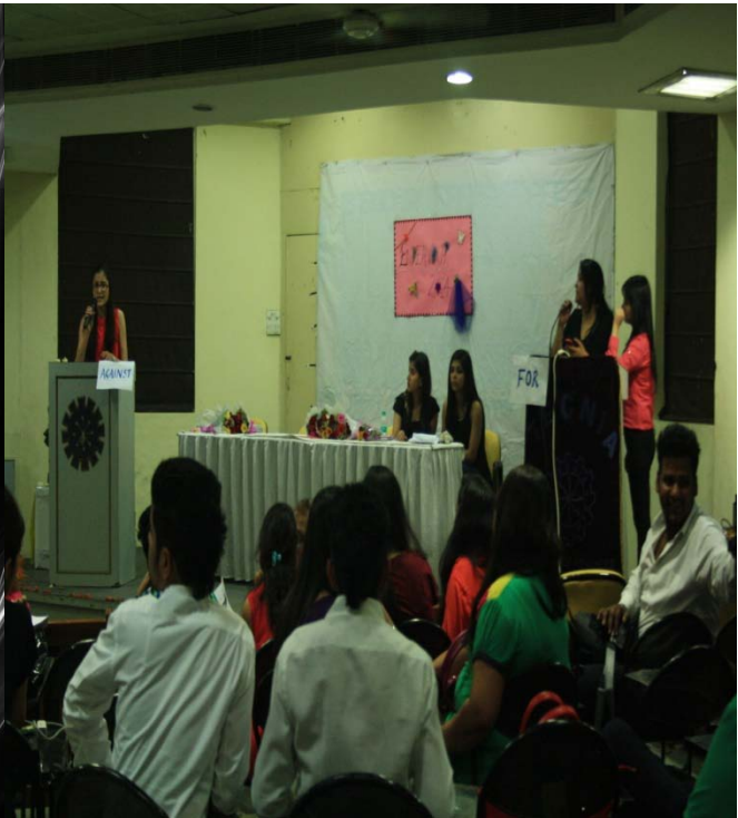
Students' Participation in Debate