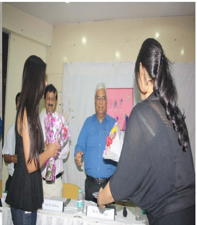
Chairman, Tecnia Group of Institutions being greeted by Director & Students of TIAS

An ISO 9001:2008 Certified Institute; Rated as 'A' by Govt. NCT of Delhi; "A++" Category - Best Business School by latest AIMA - Business Standard & Business India Publications Surveys & included in Top 100 B & IT Schools by Dalal Street Investment Journal