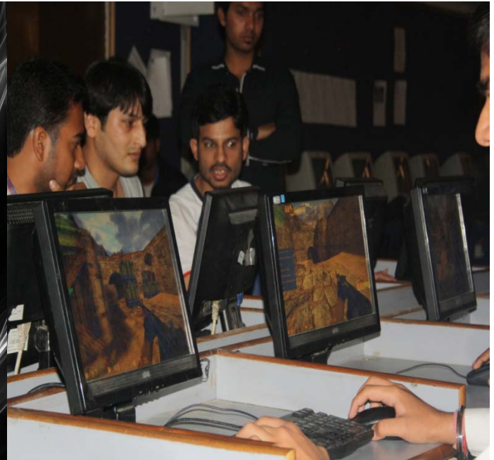
Students' Participation in Lan Gaming