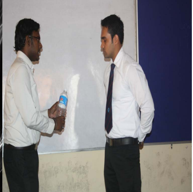
Students' Participation in Sales Gorilla