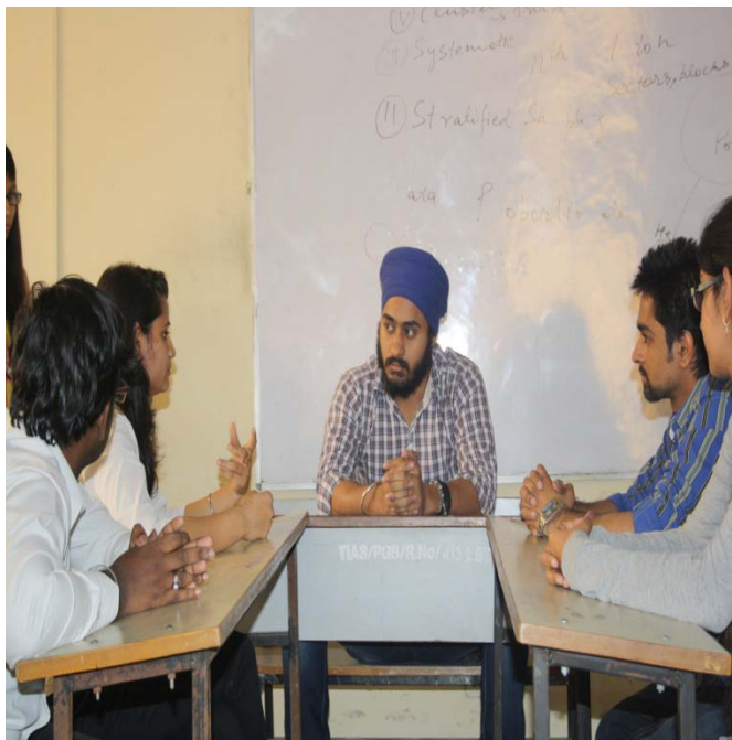
Participants in Board Room Battle