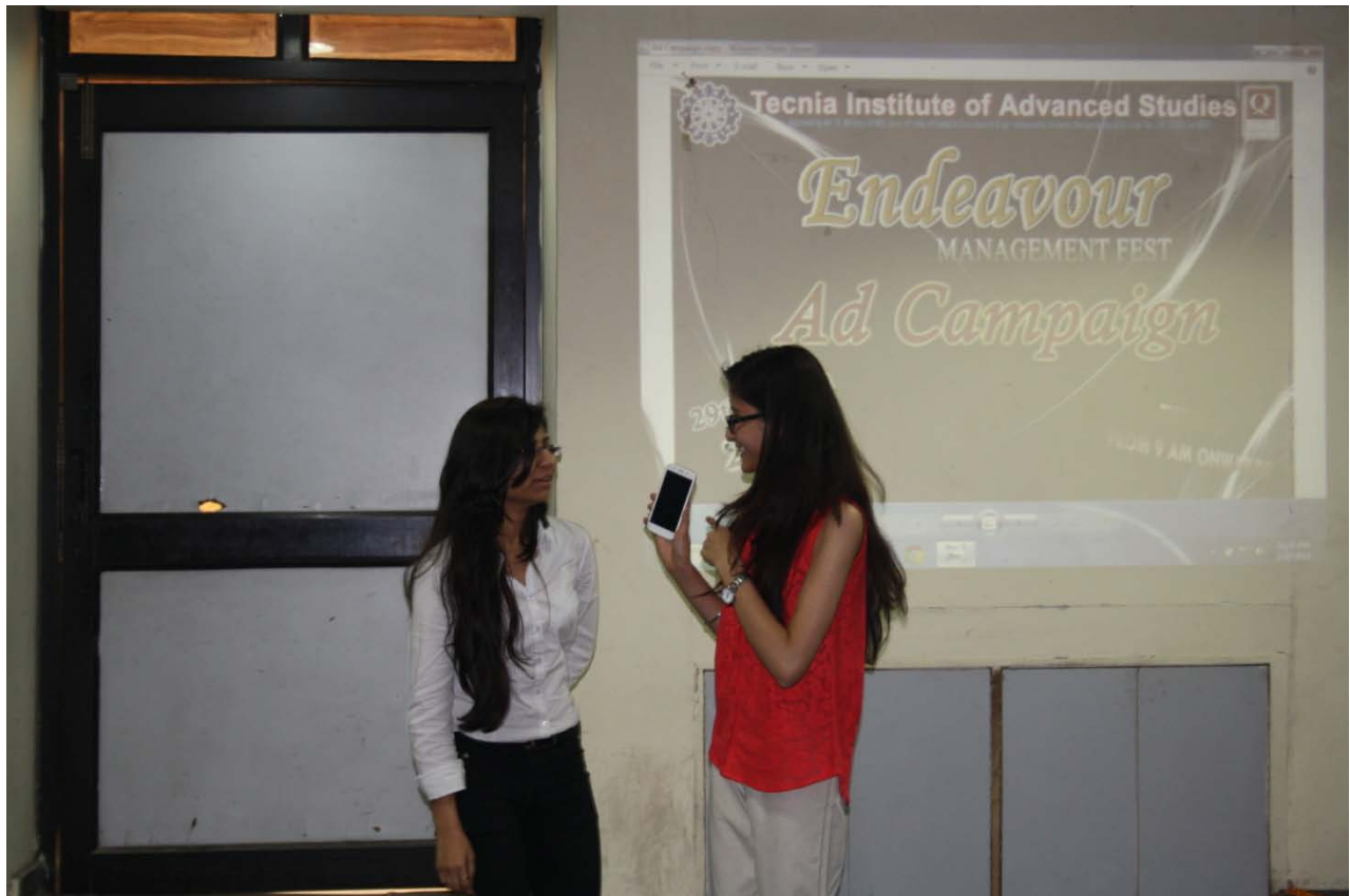
Students' Participation in Ad Campaign