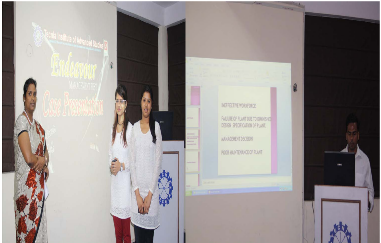
Faculty Mentor, Student Coordinator & Participant in Case Presentation