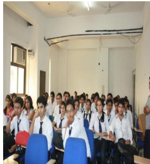
BJMC I students listening to speakers