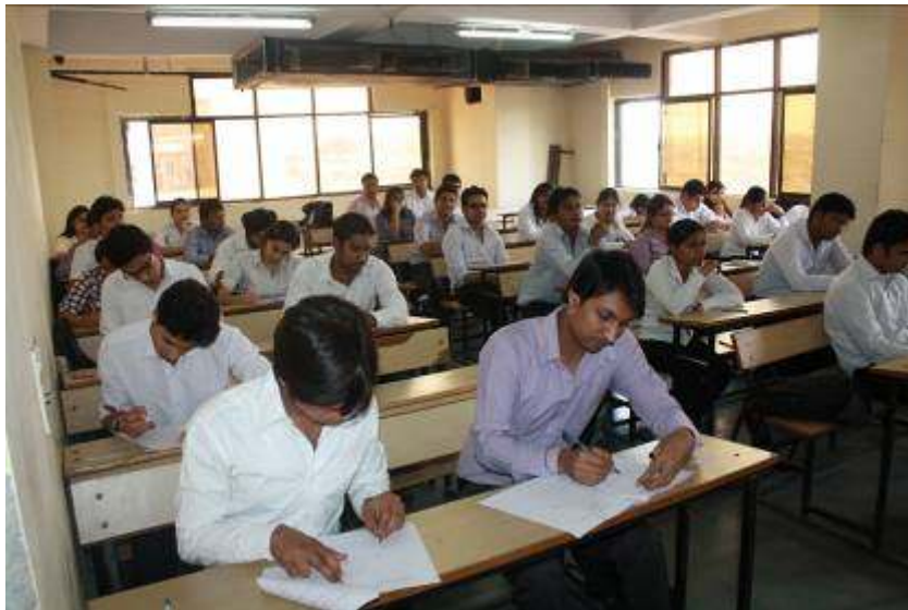
Ms. Arti interacting with the students

We seek the best talent and are committed to their development as we strongly believe that people are our most valuable asset.