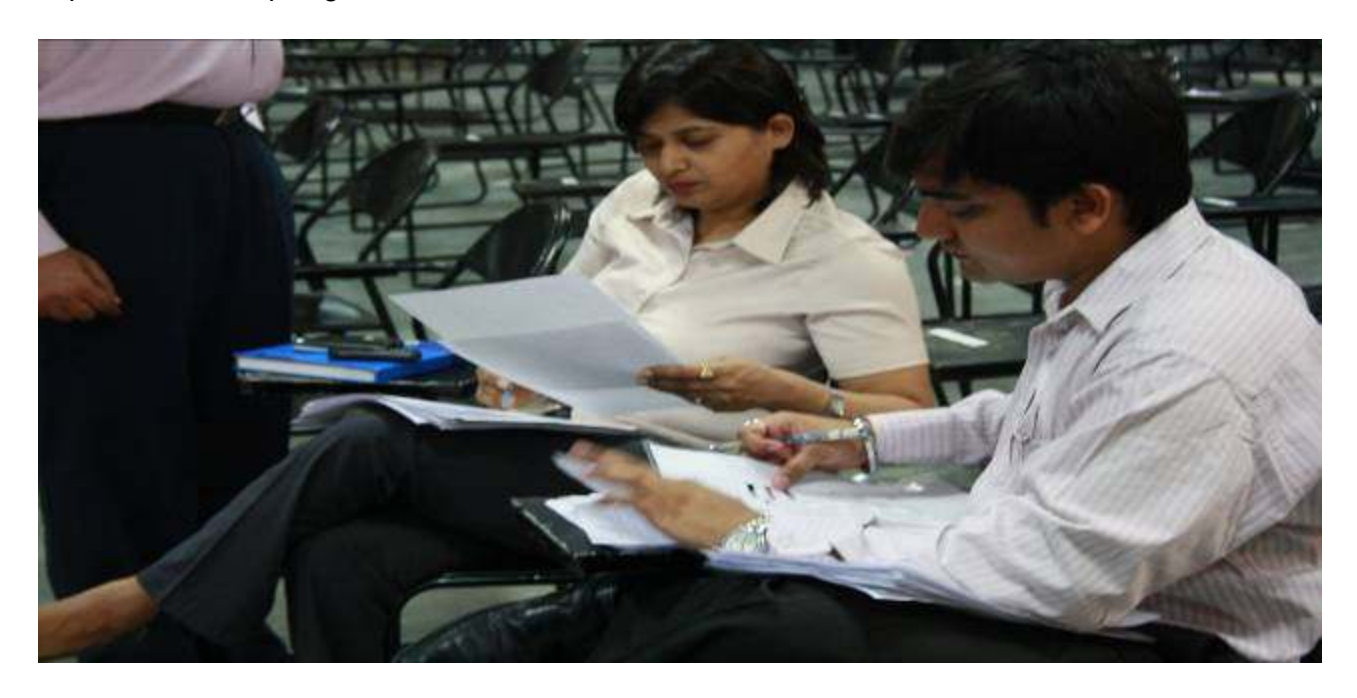
HCL Official from HCL and PIET Scrutinizing student's applications

Ensuring Collaboration to Corporate ( HCL ) and Institute ( PIET ) with an objective to render support and exposure to all aspiring students from Tecnia and other Institutes.