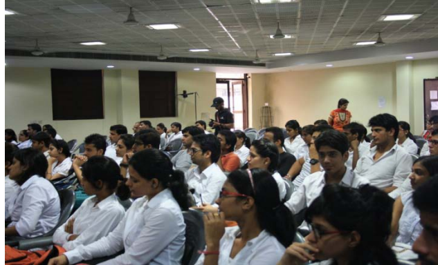
Students and Faculty Members Attending the Workshop