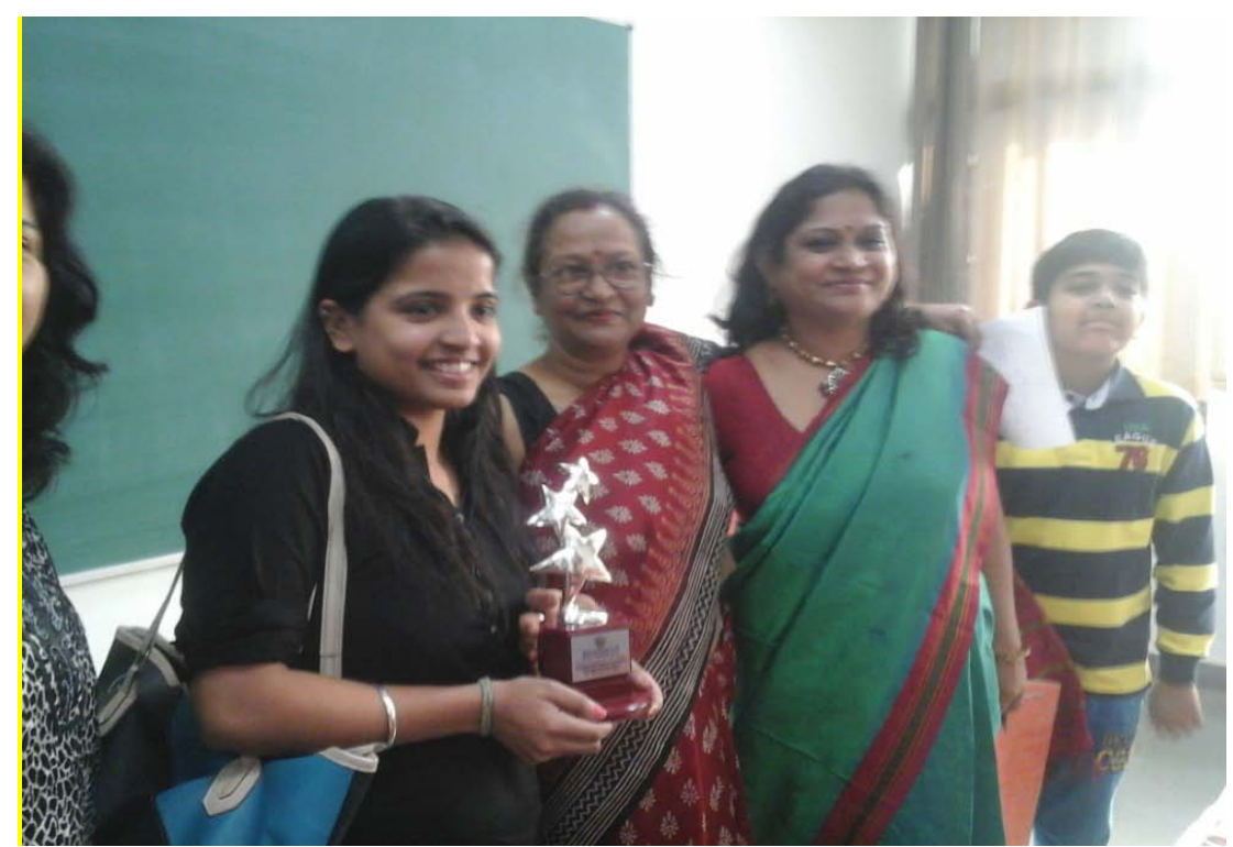
Second prize Winner for on the spot painting at GGSIPU, Anugoonj