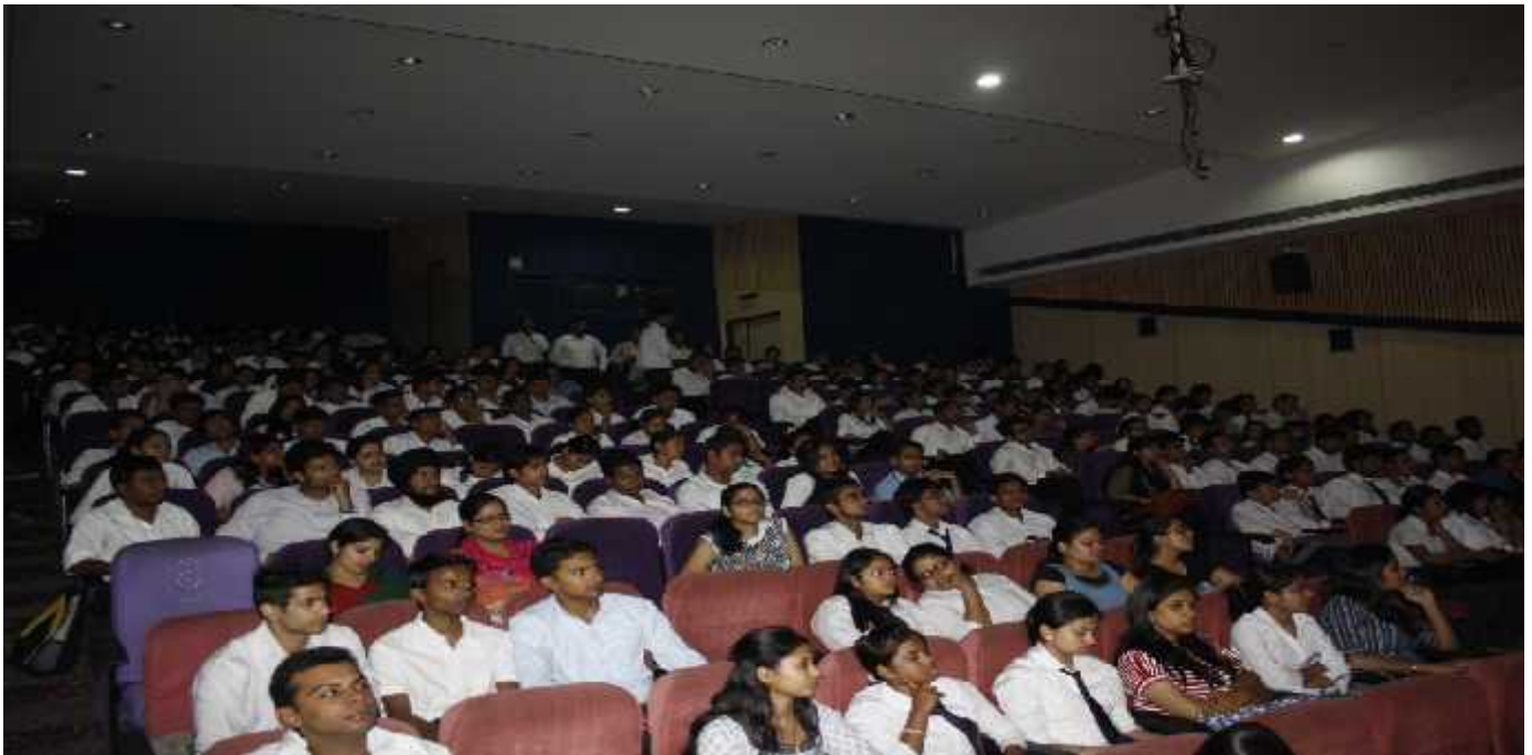
Students listening the deliberations on Entrepreneurship Development