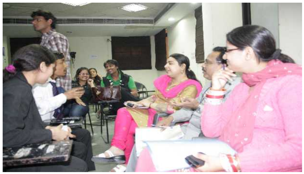
Management Game-Sales Gorilla in Progress