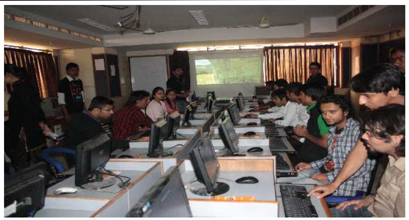
Students Participating in the LAN Gaming

Approved by AICTE, Ministry of HRD, Govt. of India Affiliated To Guru Gobind Singh Indraprastha University, Delhi INSTITUTIONAL AREA, MADHUBAN CHOWK, ROHINI, DELHI- 110085 E-Mail: director.tecniaindia@gmail.com, Website: www.tecnia.in Fax No: 27555120, Tel: 27555121-24