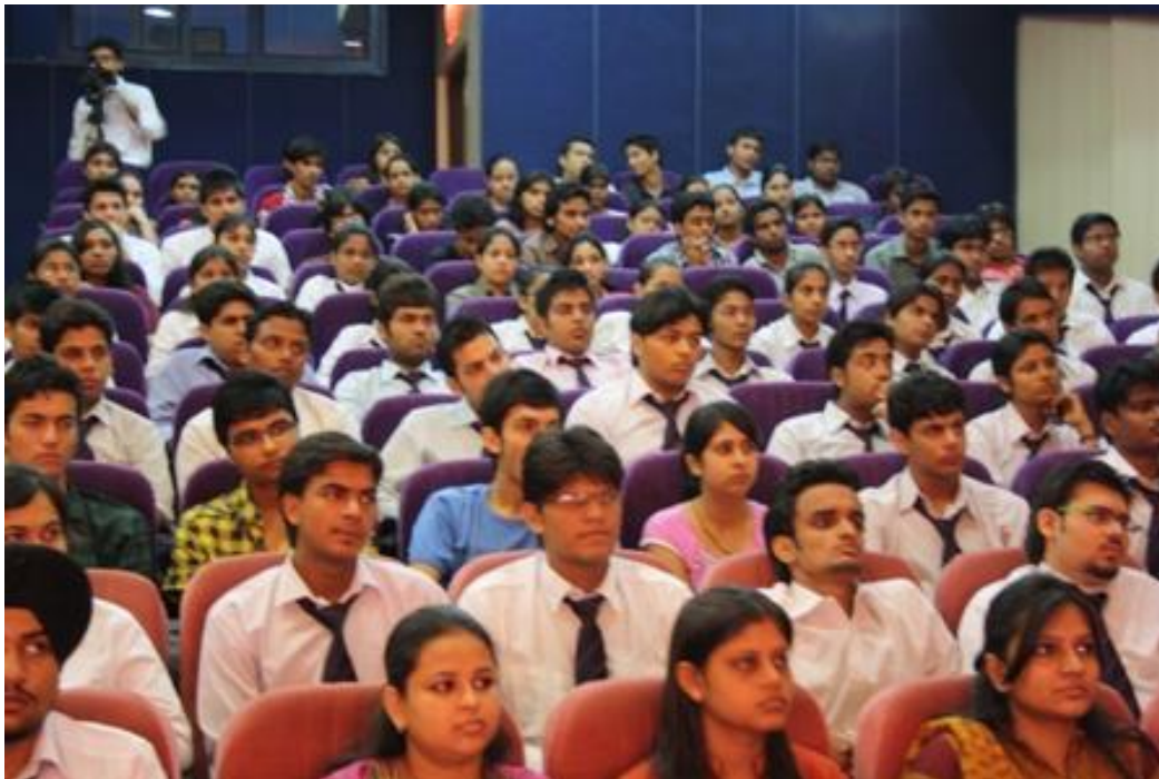
Fresher students listening carefully during orientation and induction program in Tecnia Auditorium

Institute is rated as "A" Category Best Business School by latest AIMA - Business Standard & Business India Publications Surveys & Included in Top 100 B – Schools & IT -Schools by Dalal Street Investment Journal