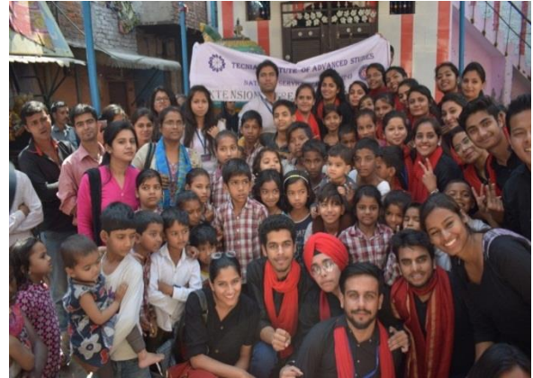
Group Photograph of Tecnia Group

Learning Outcome: Nukkad Natak helps the slum dwellers to understand about Drug Addiction and how it is important for the family to maintain healthy and wealthy life. Students of different programmes who have participated in the Nukkad Natak they show case their talent.