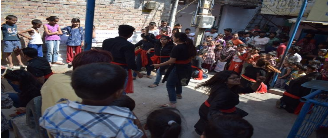
Students Performing “Nukkad Natak on Drug Addiction