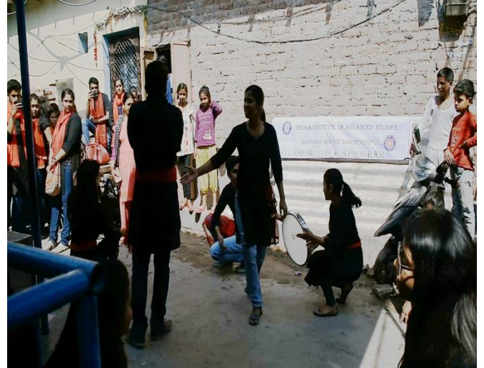
Students Performing “Nukkad Natak on Drug Addiction