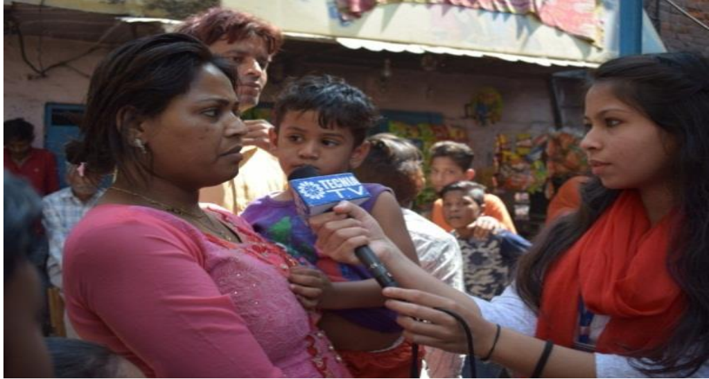
Taking opinions from local peoples in reference to Nukkad Natak