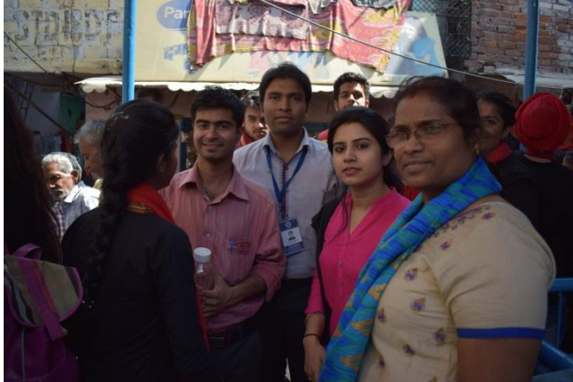
Students taking byte from Faculties about Natak