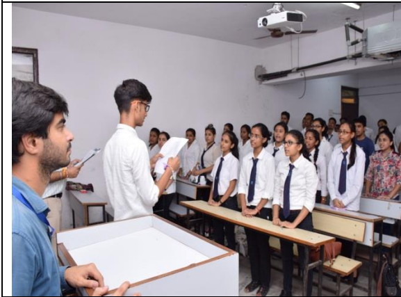
Students of Tecnia taking Pledge for INDIA 2017-2022