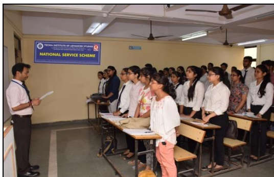
Students of MBA taking Pledge for INDIA 2017-2022