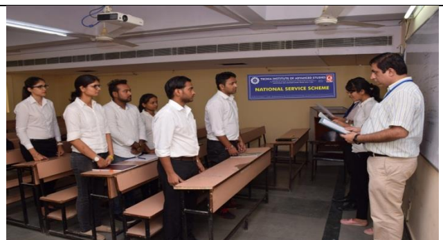
Students of MCA taking Pledge for INDIA 2017-2022